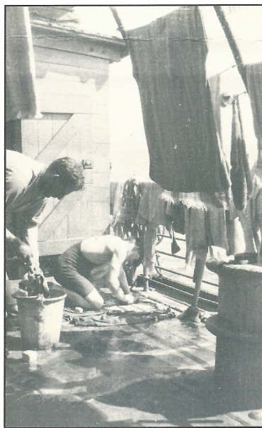
"Washing day" for the troops aboard "Port Sydney"