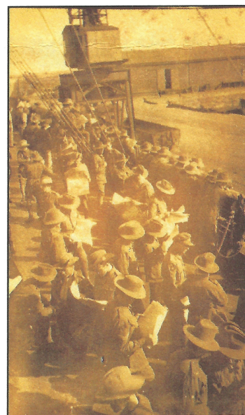
Finally in port - now the endless wait to disembark!