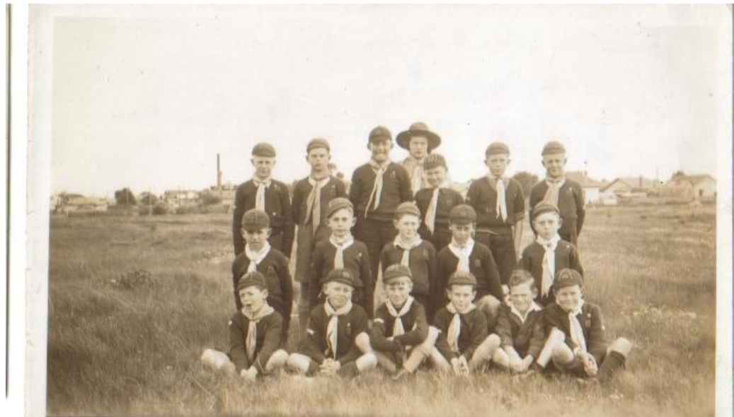
1940s -50s from Cheltenham Park looking towards Highett. Note the Gas works Chimney in the background.