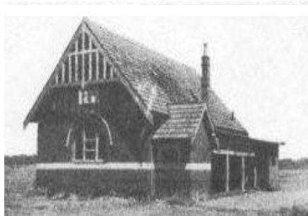
2 nd St Peter's School 1903