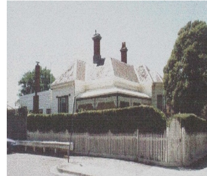
9 Vickery Street

http://vhd.heritagecouncil.vic.gov.au/places/43534