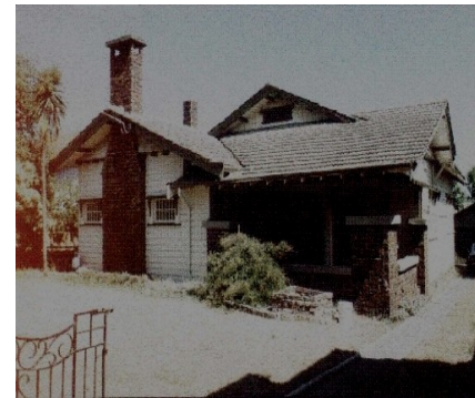
162 McKinnon Road

http://vhd.heritagecouncil.vic.gov.au/places/35277