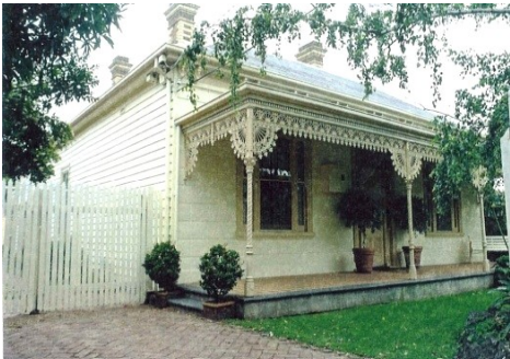
22 Brady St, Eastleigh

If you believe a place is mainly important in the context of its local area, you should contact the relevant local council for further assistance. Should you wish to nominate a place or object for the Victorian Heritage Register, you must use the Application to nominate a place or object for inclusion in the Victorian Heritage Register form (DOC 966.5 KB)