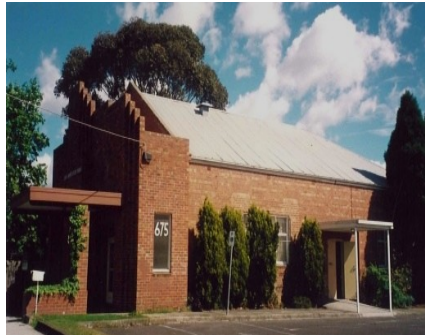
East Brighton (later East Benteigh) Public Hall

http://vhd.heritagecouncil.vic.gov.au/places/35452