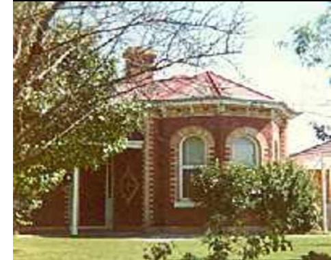
133 Tucker Rd Nat Trust B3323 more details welcome