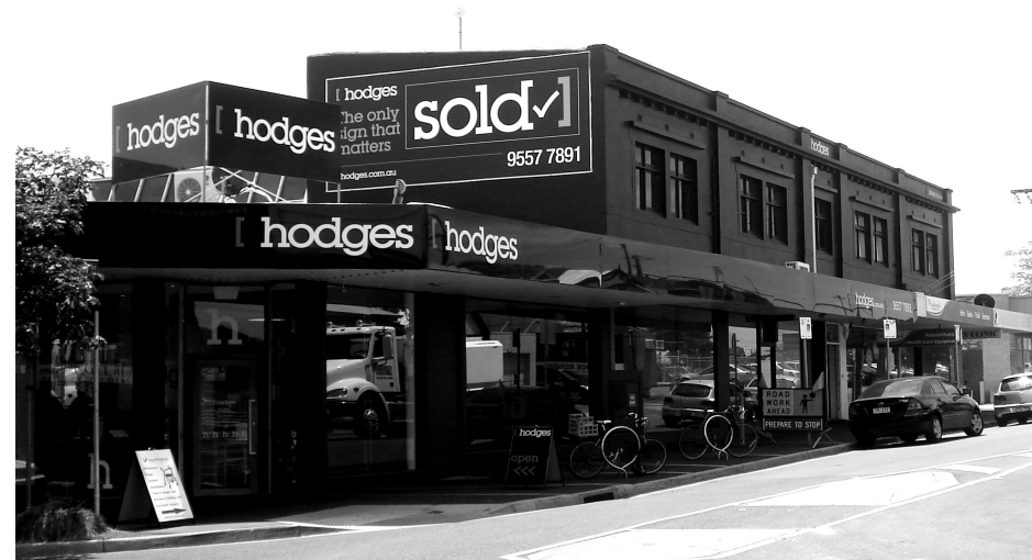
altered spaces: former Hoyts Theatre —current Hodges Real Estate Offices