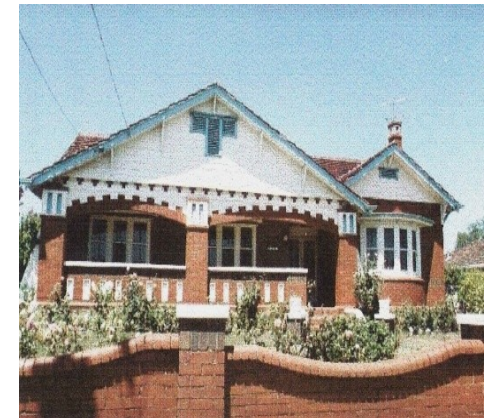
118 Jasper Road

"Glen Eira" at 118 Jasper Road [undated] is important in Benteigh as one of its finest Californian Bungalows and as the home of one of the area's most successful market gardening families, the Marriotts, who arrived in East Benteigh as early as 1878.