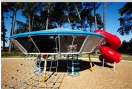
Above image reproduced from www.kingston.vic.gov.au › Outdoors