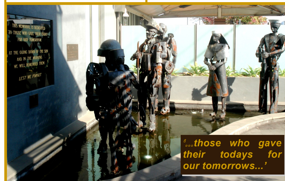
above:: wall plaque and metal sculpture installation, Bentleigh RSL forecourt (image FB April 2016)

This issue of the Moorabbin Mirror is dedicated to all the young, and not so young, men and women from the former City of Moorabbin who served 'King and Country' during the Great War. Especially those who never came home. (ctd p6)