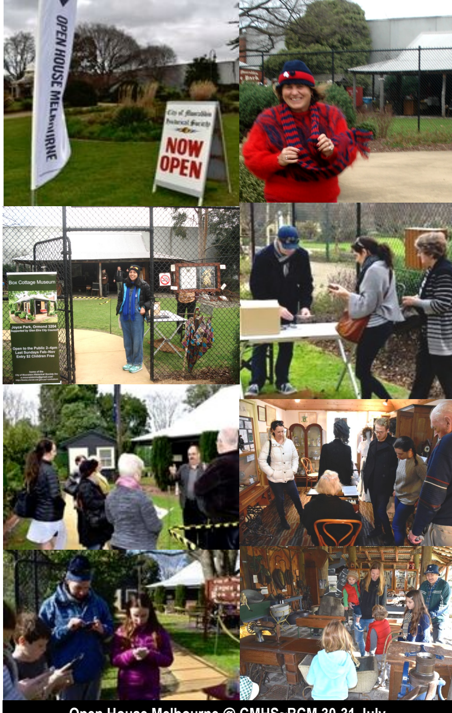
Open House Melbourne @ CMHS~BCM 30-31 July