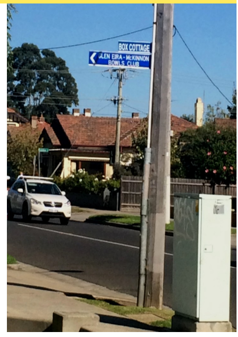
Tyrone St entrance to Joyce Park