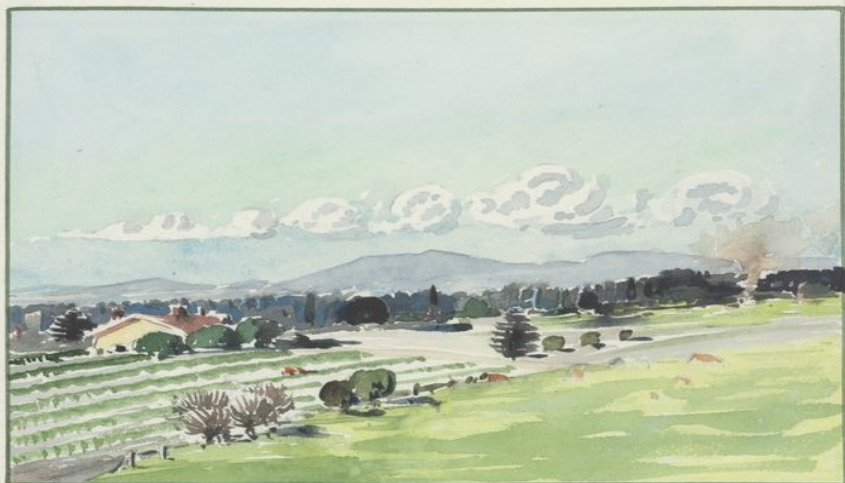
A day in early winter, near Bentleigh, Vic.