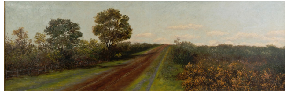
Oil Painting. South Road near Bignell Rd 1903