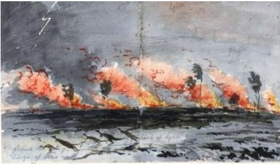
Watercolour 1854. Bush Fires in the Moorabbin District ,