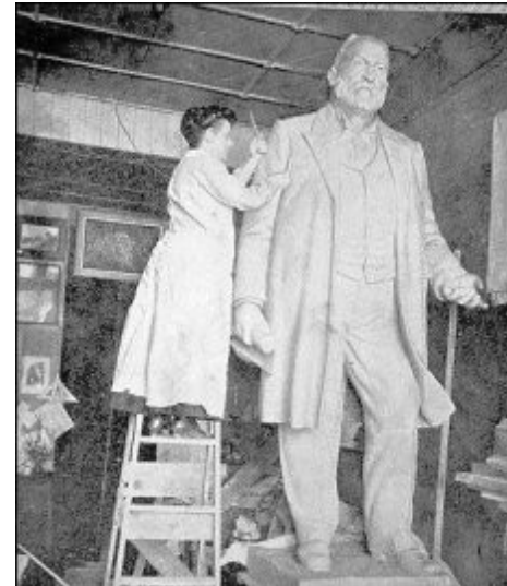
Sir Thomas Bent , 1838–1909 bronze sculpture