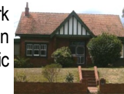
Image on right: 99 Park Street Cheltenham is an example of his domestic work.

In later life Haddon spent time travelling and painting and produced many sketch-books, which remain unpublished. (Source ADB)