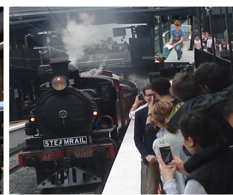
Bentleigh Station, 12 November 2016

To celebrate the removal of three contentious level crossings and the official re-opening of Bentleigh, McKinnon and Ormond stations, a big crowd (some CMHS members among them) of women, men, children lined all three station platforms on Saturday morning, 12 November 2016.