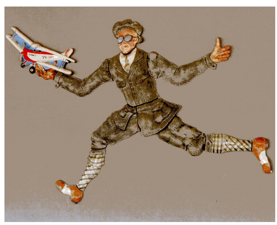
Dingley Village Danceworks (detail) supermarket mural 1997 by Hedley Potts Ceramic life-size figure of Harry Hawker, pioneer aviator, Moorabbin hero Reproduced with permission from catalogue Nominative Determinism, Hedley Potts Retro @80 produced for Hedley Potts' exhibition at Glen Eira Town Hall, 3-20 November 2016.