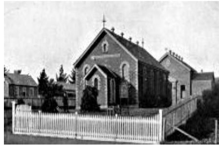
Cheltenham Church of Christ, ca 1920