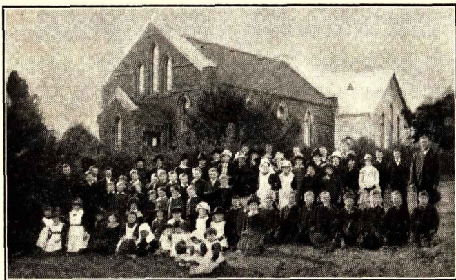
Centre Road, Bentlygh, Methodist Sunday School, 1886.