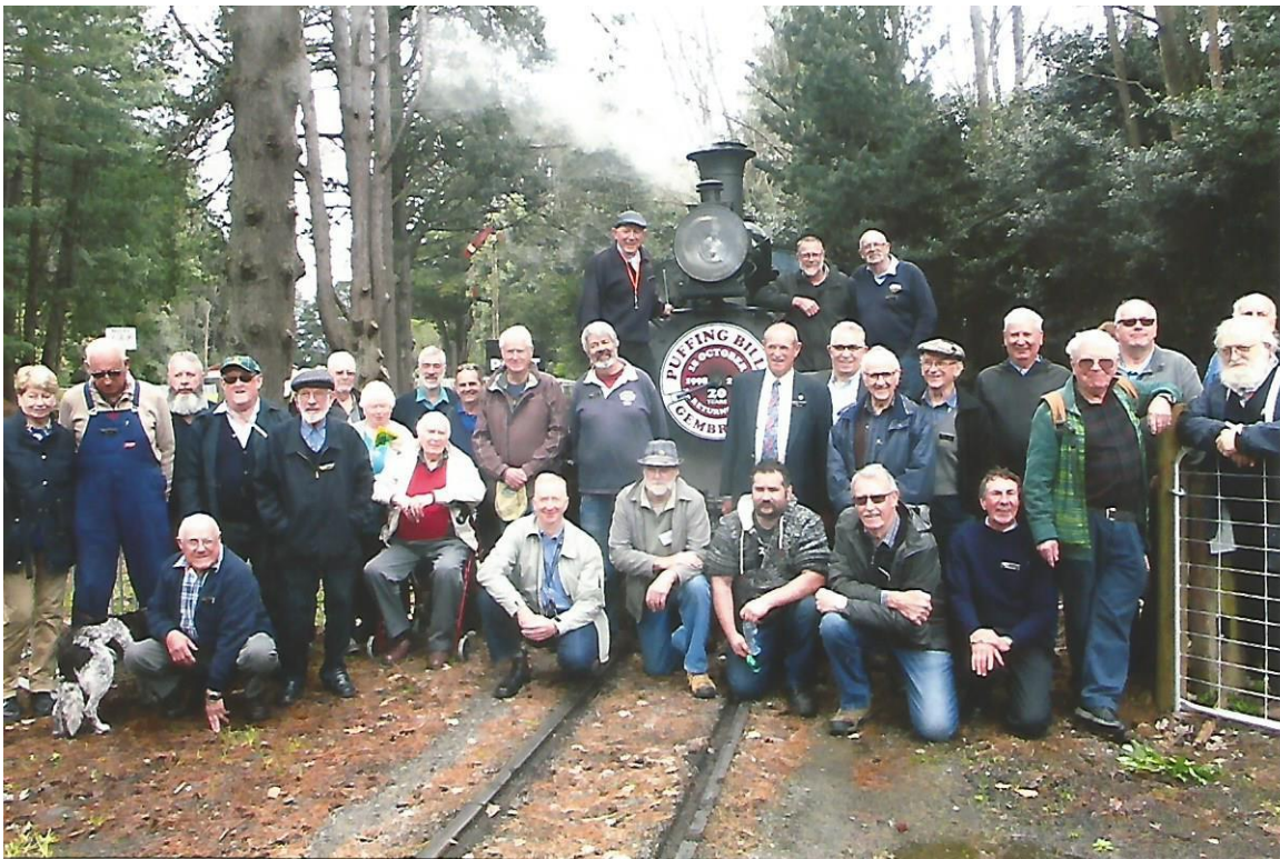
Proud volunteers 'together again' on October 18. 2018.

So, like all good fairy stories, through good and bad times this story had a happy ending. And fairy tales sometimes do come true?