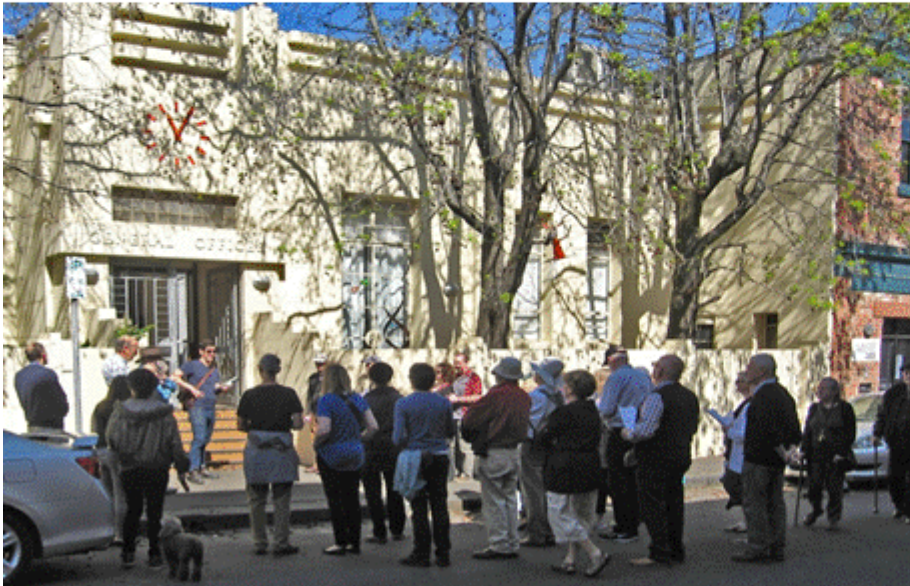
Seb Costello speaking outside the building at 214 Argyle Street that housed MacRobertson's head office.