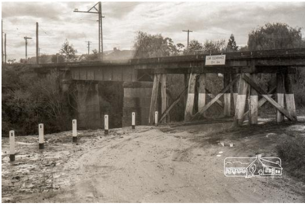
Photo 1 – c 1970

Approximately 40 meters long and 15 meters above the Plenty River.