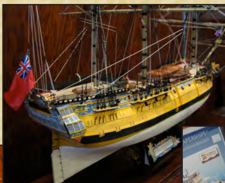
Pictured are HMS "Bellona", German Cruiser "Emden", the Sydney Ferry "Golden Grove" and the Murray River Paddler "Alexander Arbuthnot". The Paddle Steamer "Pevensey" is also available.