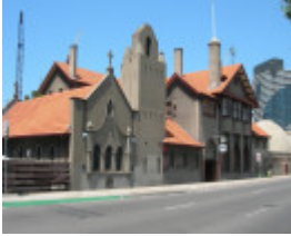
MISSIONS TO SEAMEN SOHE 2008