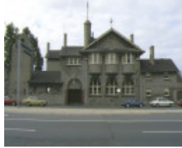
1 missions to seamen flinders street extension melbourne front elevation feb1986