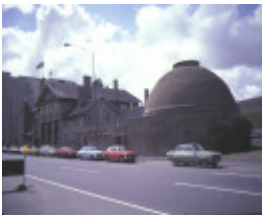
Missions to Seamen Flinders Street Extension Melbourne Dome January 1985