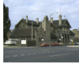
missions to seamen flinders street extension melb side elevation feb1986