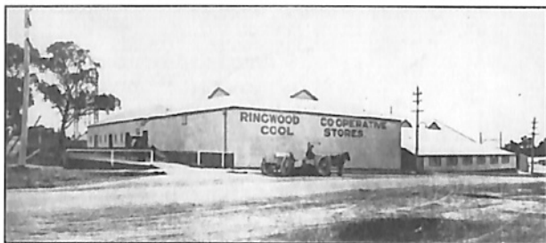
RINGWOOD COOL STORES

Packed with thousands of cases of Rosy Apples—that make the Rosy Checks.