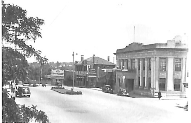
SERIES No. 2

Return to the highway where, at the northwestern corner of Melbourne Street, was the Town Hall of the Borough of Ringwood, built in 1927 and demolished in 1970. The Borough of Ringwood became the City of Ringwood and merged with the City of Croydon (and parts of the adjacent municipalities) in 1994 to become the City of Maroondah. Photograph circa 1936.