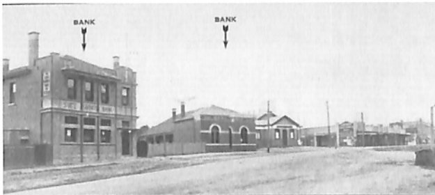
THREE SOLID BANKS—and more coming.

Banks don't build premises like this in suburbs without a future. Take the Hint.