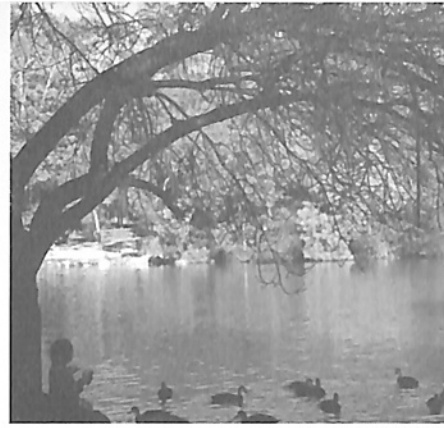
Ringwood Lake