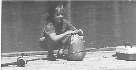
The fish are biting at the Ringwood Lake