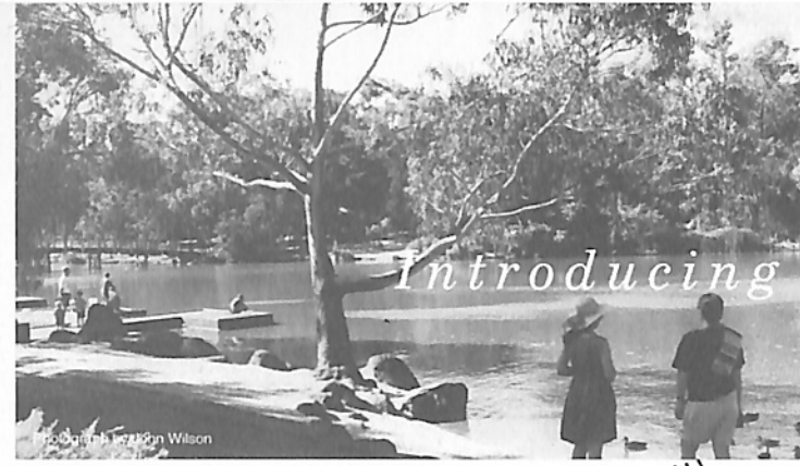
Ringwood Lake