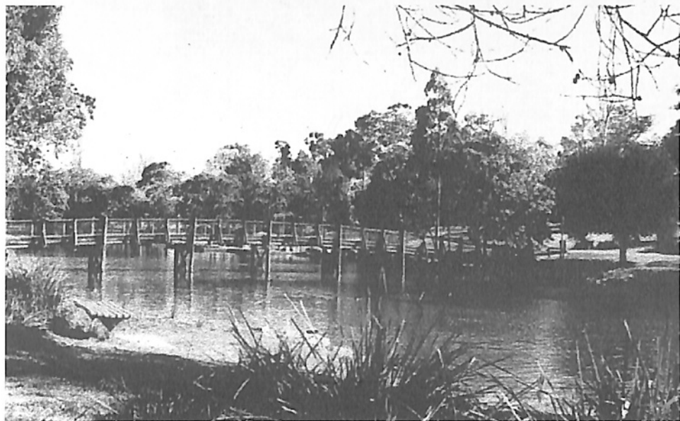
RINGWOOD LAKE, Originally Sandy Gully Creek