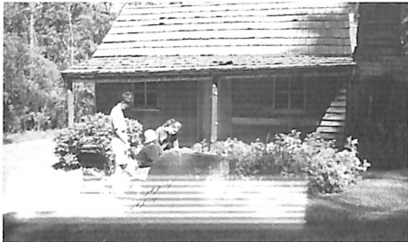
Miner's Cottage, part of Maroondah's antimony mining history