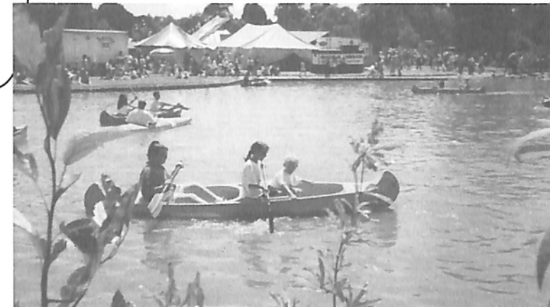
Canoeing on Croydon Lake