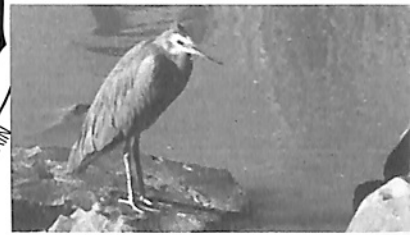
White Faced Heron at Croydon Park