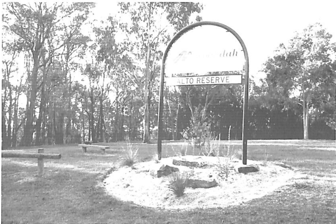
Alto Reserve - (Stop 6)

START on the northern side of CROYDON RAILWAY STATION (first called Warrandyte Station when opened in 1882.) The surrounding area had been known as White Flats because of the profusion of white wildflowers.