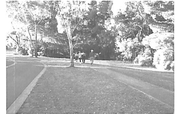
Along Banjora Close.