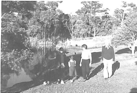
The lake near Lakeside Crescent.