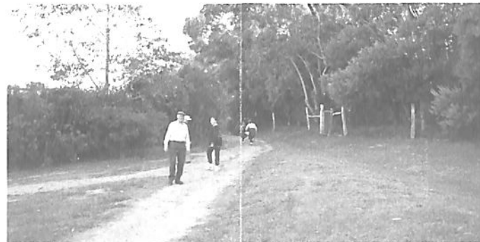
Views along the Croydon Hills Scenic Walk