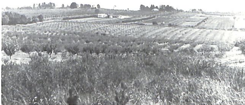
Smiths' orchards prior to subdivision in 1985.