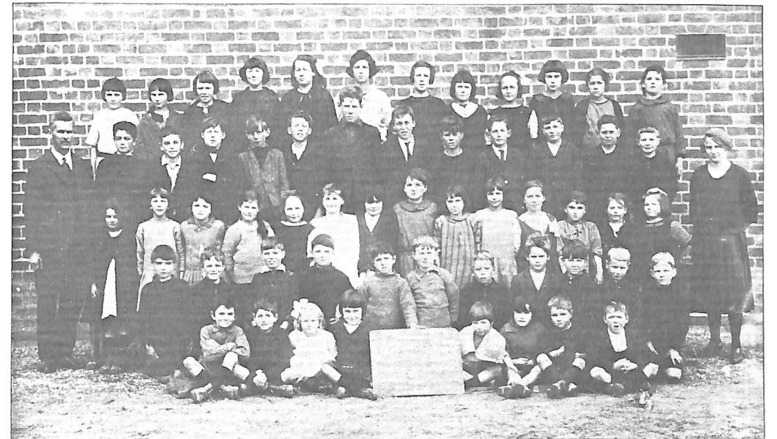
First Students 1924