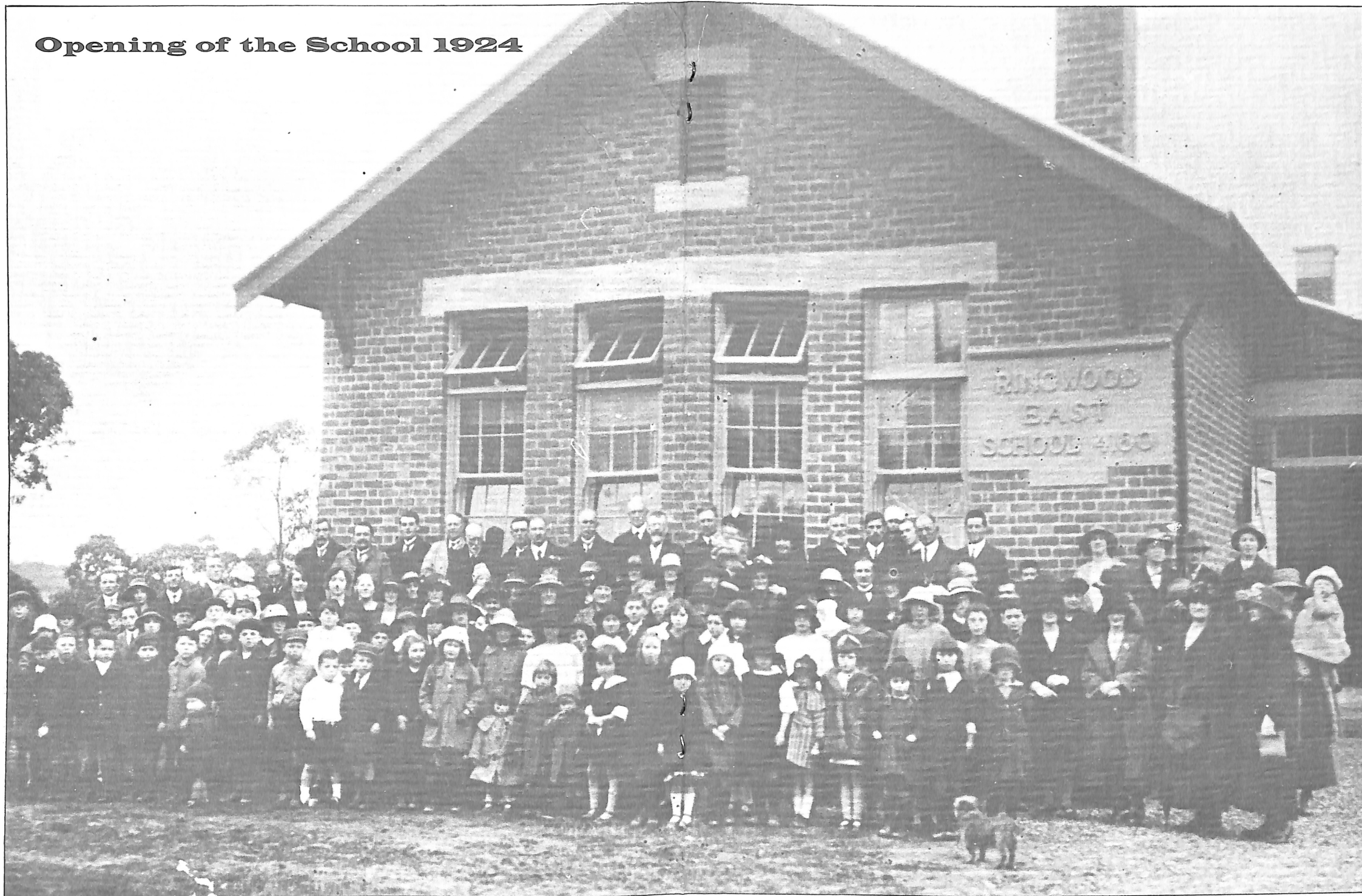
Opening of the School 1924