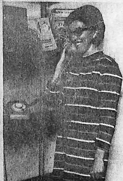
Better Communications at East Ringwood and Our Lady's.

In middle 1953 whilst I was a member of the Ringwood Conference of St. Vincent de Paul Society, I read an appeal in the Advocate from the Central Council to all Catholic men who had experience in Scouting to