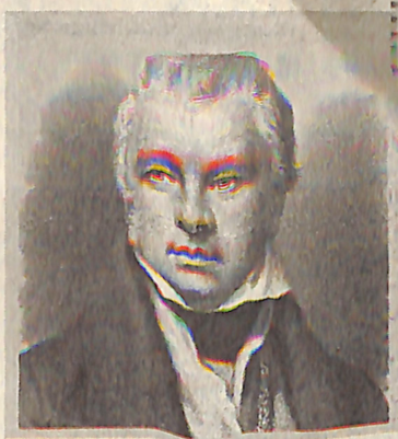
Sir Walter Scott: didn't let facts spoil the yarn.

sense. "In other cases, metaphors disappear and are replaced by less effective words.