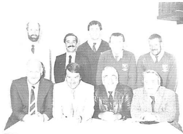
UMPIRES BOARD AND UMPIRES ASSOCIATION

As members of the league, I would like to extend our congratulations and appreciation to the umpires for their valuable assistance to the league.