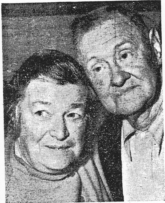
A 68-YEAR-OLD man was burned to death in a Berwick house early yesterday, but his 72-year-old brother and the brother's wife escaped.