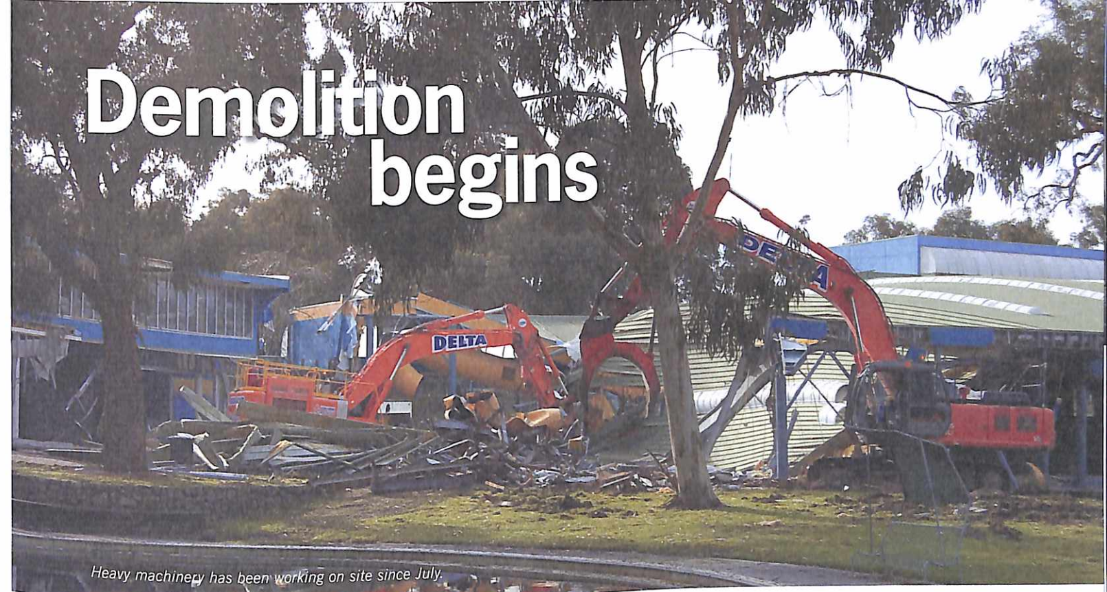
Heavy machinery has been working on site since July.

The construction of the new state of the art Ringwood Regional Aquatic and Leisure Centre is one step closer, with the site currently being cleared.