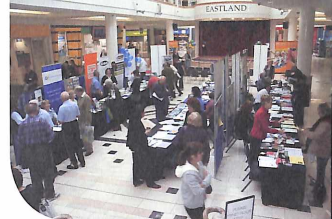
Last year's Seniors Wellbeing Expo was a huge success, so make sure you don't miss the next one on Monday 29 October.

Council, in partnership with Eastland shopping centre, is also hosting a free Seniors Wellbeing Expo. The event will link Maroondah's seniors with services and