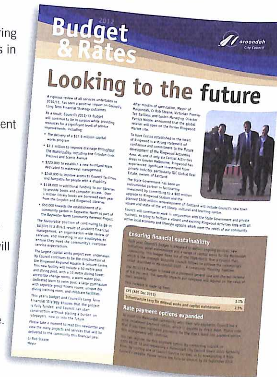
The 2012/13 Budget & Rates brochure has been distributed to ratepayers.

To register for this payment method contact Council to request a Direct Debit Authority form, or download it from Council's website. The form must be returned to Council by 20 September. If you have already registered for direct debit previously this process will continue.