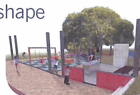
An indicative image of how the new Sherbrook Park could look.

During consultation earlier this year, the local community provided feedback on the elements they would like to see included in the park. The most popular requests were for barbecues, playground equipment,