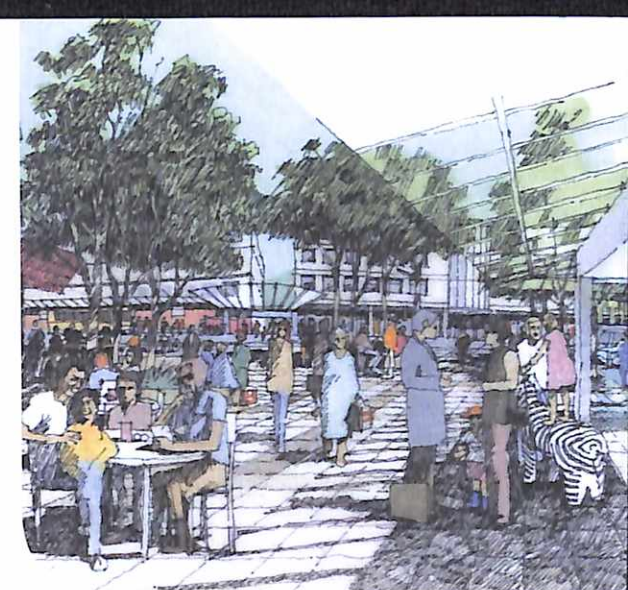
An indicative image of the future Croydon laneway.

This area will link Main Street with both the station and the proposed redevelopment of the Croydon Central Shopping Centre.