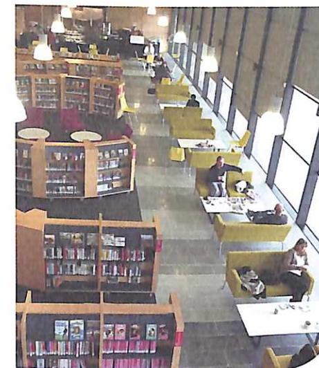
Once completed the Ringwood Library, Learning and Cultural Centre will provide access to the best community facilities and services available.

Preliminary works have already commenced on site, with $5 million being invested to relocate Kmart Tyre and Auto, create new access ramps, and undertake other utility works around the boundary of the site.