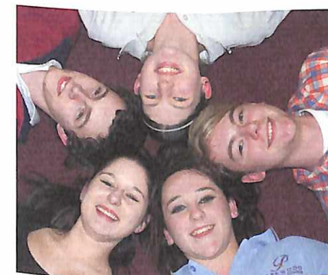
A group of Maroondah's young people assisted Council by conducting six months of consultation with their peers.

The voices of Maroondah's young people are being heard loud and clear! Following Council's largest ever youth community consultation, Council is developing the Maroondah City Council Youth Plan 2012-2016. The Youth Plan will guide Council's work with, and for, young people over the course of the next four years.