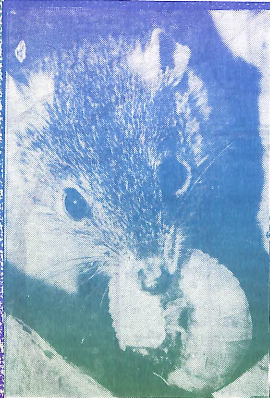
THIS ANTECHINUS IS FEEDING ON INSECT LARVA. LOOKS LIKE HE IS ENJOYING HIS MEAL!

The NINGAUIS species is only about 71 millimetres long, which is about half the size of the domestic mouse. Ningauis are only found in Australia. They seem to like areas with sandy surfaces. They eat insects including beetles, grasshoppers, moths and cockroaches. They kill their prey by biting around the head in a swift, savage attack. They hide in hollow branches, shelter under small thick bushes or dig burrows. The nest itself is made of leaves and bark.