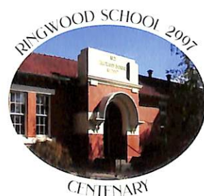
Collector's Centenary mugs available only today