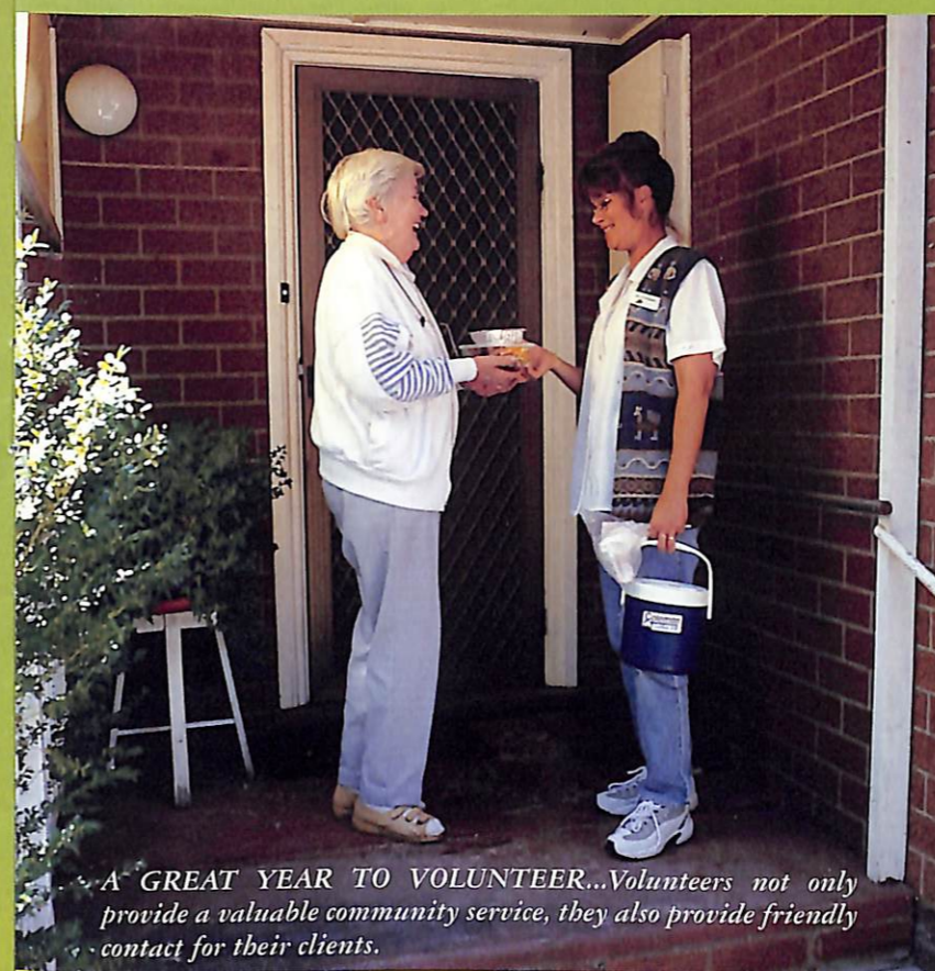
A GREAT YEAR TO VOLUNTEER...Volunteers not only provide a valuable community service, they also provide friendly contact for their clients.

Caring people with a few hours to spare can join the volunteers working in these areas. Council can help find the right placement to suit the time and capacities a volunteer has available. For further information contact Council's Community Services Unit, phone 9298 4275.