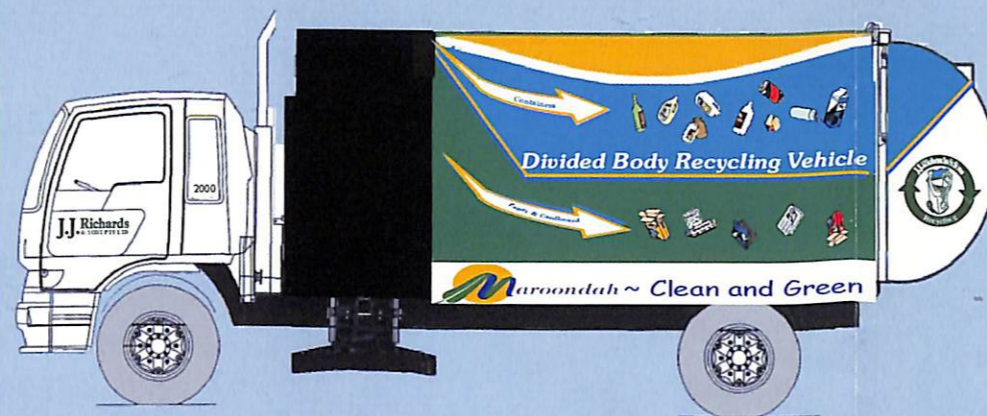
ROLL-OUT OF NEW WASTE SERVICE...Our new rubbish collection trucks.

The old crate for recyclables is being replaced with a 240 litre Split Bin with a blue lid - one side for paper and cardboard and the other for bottles, drink containers, cans and jars. This will