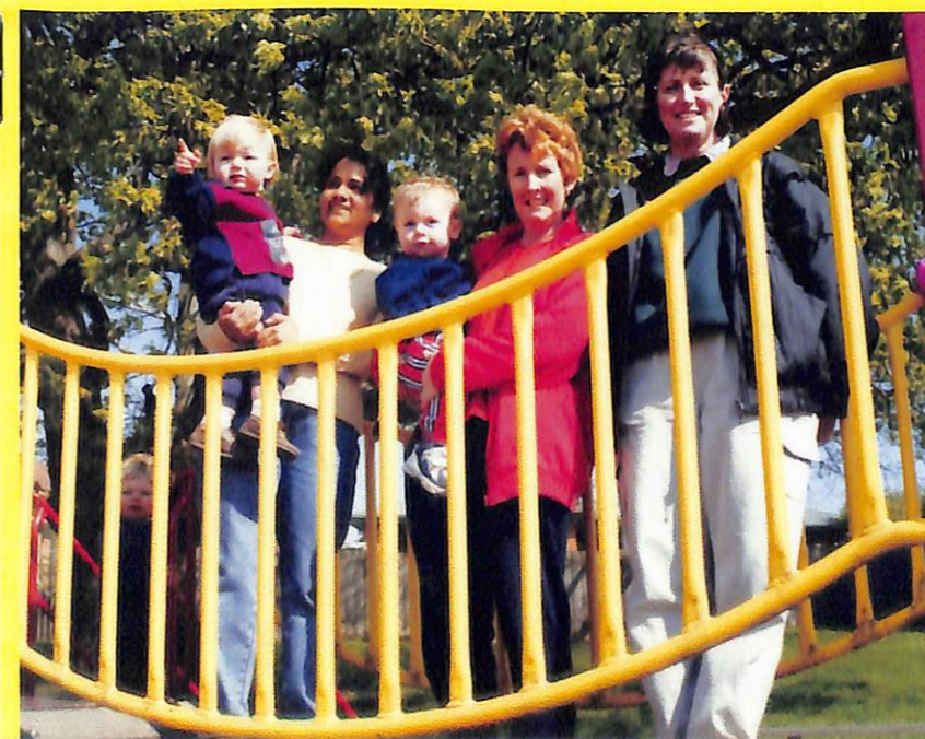
SHARING THE CARE...Careproviders and the children in their care get together at local parks for fun.

For more information on the service contact Maroondah Family Day Care on 9298 4254.