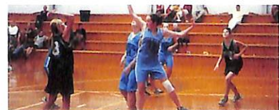
7 Discover some of the sporting and community activities Maroondah has to offer