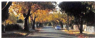
5 A new Amendment to the Planning Scheme promotes character and protects neighbourhoods