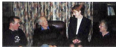
5 Funding assistance helps community groups