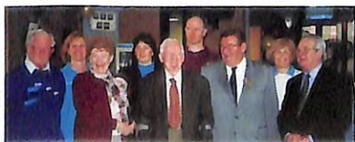
2 Croydon Leisure Centre celebrates 25 years of service