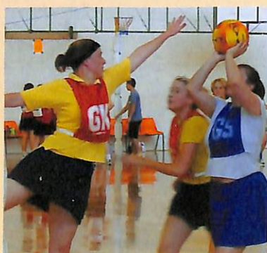
Netball is a fast, fun sport.

If you love netball , women's and mixed competitions are held on three nights a week. You can register your own team or ask to be placed, as an individual, in an existing team.