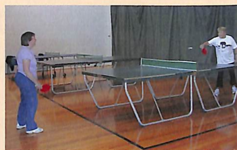
Table tennis is just one activity that is enjoyed by members of the Silvers Club.