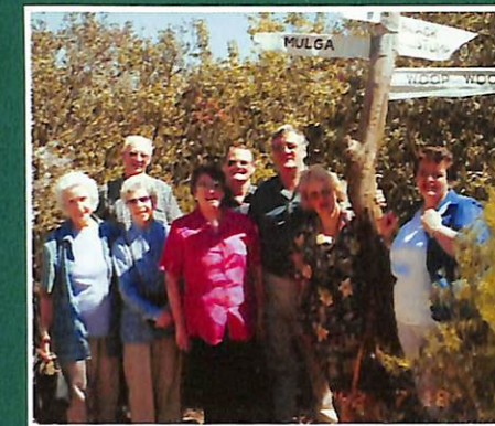
Just some of the happy participants on an excursion last year.

For further information on Maroondah's celebration of seniors month during March contact Council on 1300 88 22 33. Alternatively, pick up a program from Council's Service Centres or local libraries.