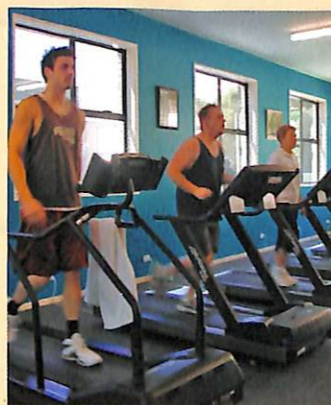
Get on track to looking and feeling good at the gym.

Contact 9294 5500 for further information or just pop into Croydon Leisure Centre at Civic Square, Croydon.