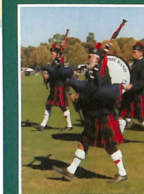
The Highland Games promises a full day of fun for the whole family.

further information, contact Sue Macleod on 9876 4140.