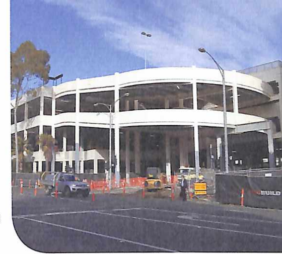
The new ramps at the Warrandyte Road entrance to Eastland are nearing completion.

Preliminary works have already commenced on site, with $5 million being invested to relocate Kmart Tyre and Auto, create new access ramps, and undertake other utility works around the boundary of the site.