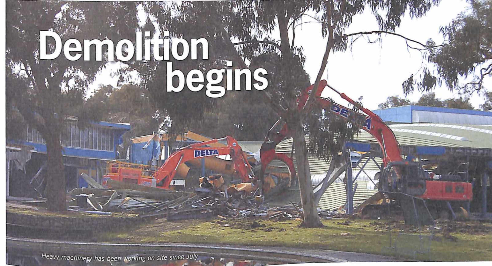
Heavy machinery has been working on site since July.

The construction of the new state of the art Ringwood Regional Aquatic and Leisure Centre is one step closer, with the site currently being cleared.