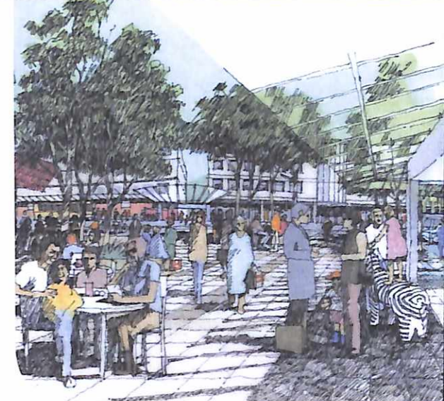
An indicative image of the future Croydon laneway.

This area will link Main Street with both the station and the proposed redevelopment of the Croydon Central Shopping Centre.