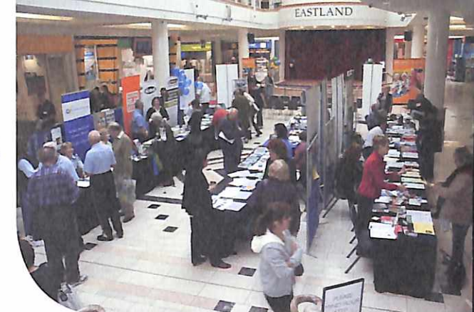
Last year's Seniors Wellbeing Expo was a huge success, so make sure you don't miss the next one on Monday 29 October.

social opportunities, as well as providing ideas on how they can increase their community participation.