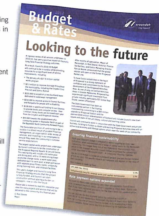
The 2012/13 Budget & Rates brochure has been distributed to ratepayers.

To register for this payment method contact Council to request a Direct Debit Authority form, or download it from Council's website. The form must be returned to Council by 20 September. If you have already registered for direct debit previously this process will continue.