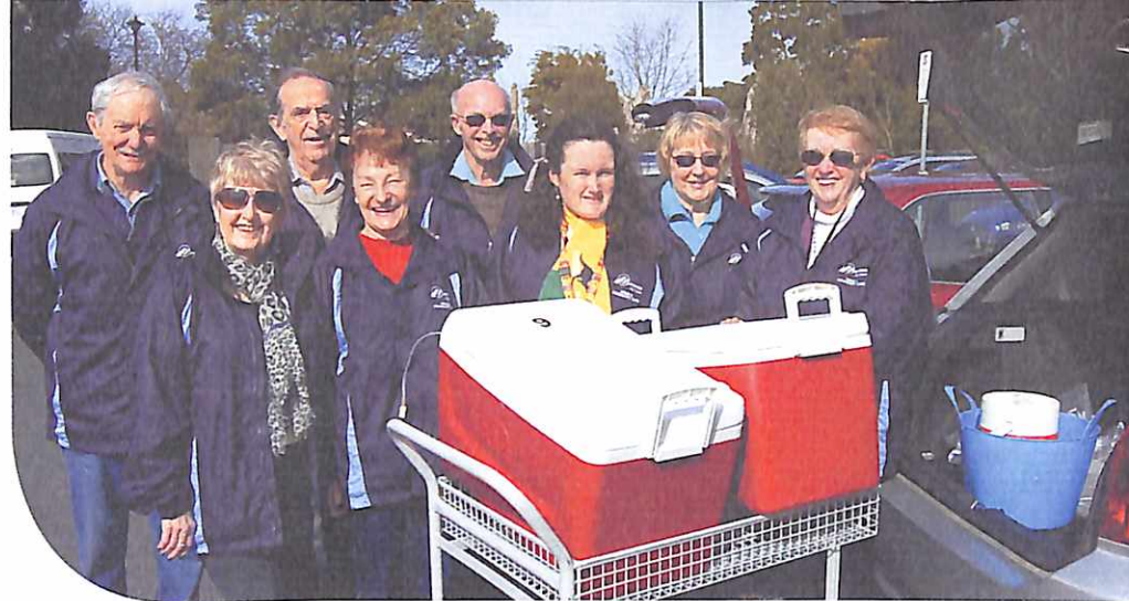
Maroondah has more than 120 volunteers who assist Council with the Home and Community Care Meals on Wheels program.

Want to become a Meals on Wheels volunteer? Find out more by calling 9298 5729.