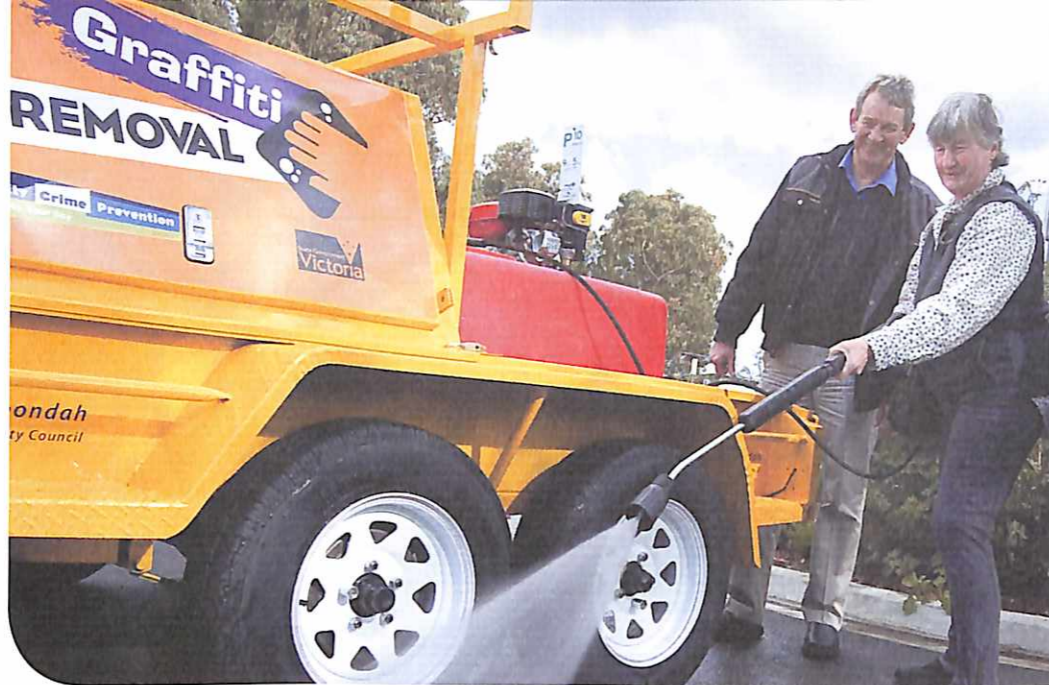
The Community Graffiti Removal Trailer is available for use by community groups wanting to clean up their facilities.

All first time users must attend a 30 minute induction session hosted by Council.