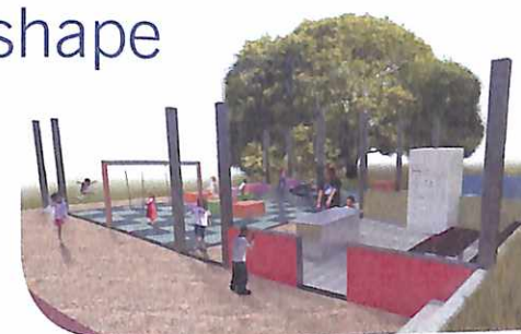
An indicative image of how the new Sherbrook Park could look.

During consultation earlier this year, the local community provided feedback on the elements they would like to see included in the park. The most popular requests were for barbecues, playground equipment,