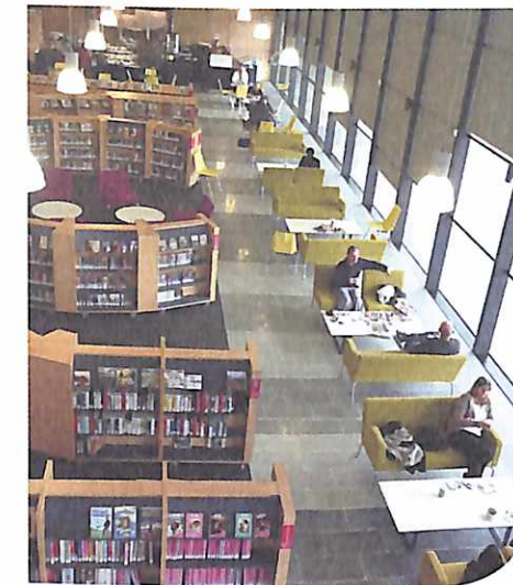
Once completed the Ringwood Library, Learning and Cultural Centre will provide access to the best community facilities and services available.