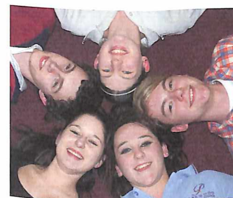
A group of Maroondah's young people assisted Council by conducting six months of consultation with their peers.

The voices of Maroondah's young people are being heard loud and clear! Following Council's largest ever youth community consultation, Council is developing the Maroondah City Council Youth Plan 2012-2016. The Youth Plan will guide Council's work with, and for, young people over the course of the next four years.