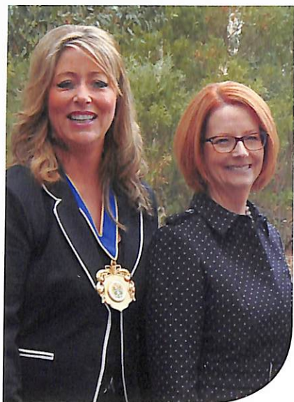
Maroondah Mayor Cr Nora Lamont and Prime Minister, the Hon. Julia Gillard.