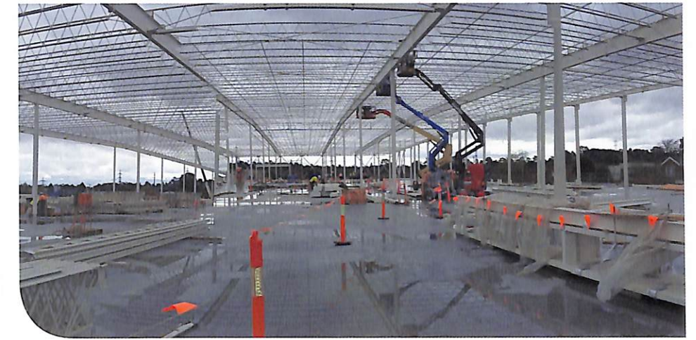
All major concrete pours for the construction of Costco have been completed, with works now focused on the steel structure and installation of the roof.

Road works will also be starting this month which will see new turning lanes, pedestrian crossings and refuges installed to improve accessibility for motorists and pedestrians in the area.