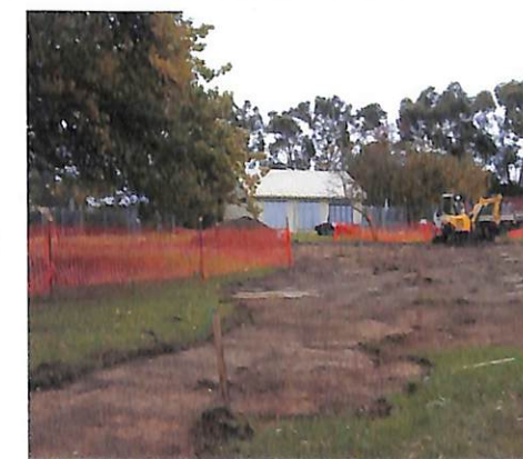
A community garden is being constructed in Glen Park Reserve, Bayswater North.

The garden, which is expected to be completed by August, will be open for the