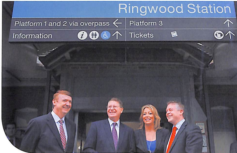
Minister for Public Transport and Roads Terry Mulder, Premier Denis Napthine, Mayor Cr Nora Lamont and Warrandyte MP Ryan Smith at the funding announcement.

The extensive works will see the creation of a fully accessible and integrated station and bus interchange with improved pedestrian amenity and shelter; a major pedestrian concourse; toilet facilities and a high quality station forecourt.