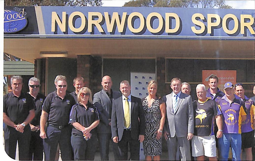
Members of the Norwood Football and Cricket Clubs with Minister for Sports and Recreation and Veterans' Affairs Ryan Smith and Mayor Councillor Nora Lamont at the funding announcement.

The redevelopment includes constructing an additional storey on the pavilion; installing a lift to ensure accessibility; upgrading the toilet facilities including a new accessible toilet; constructing six unisex change rooms;