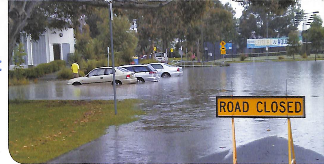
Council has allocated a further $1 million towards flood mitigation works in Civic Square Croydon in the proposed 2013/14 Budget.