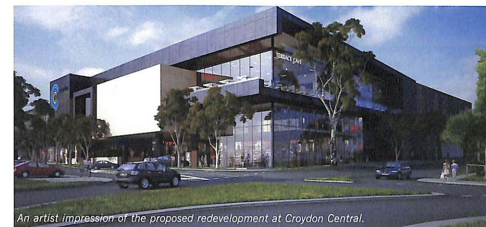
An artist impression of the proposed redevelopment at Croydon Central.