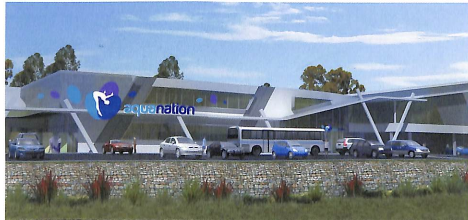
Council will be well positioned to ensure the construction of Aquanation can start as soon as possible after the funding announcement.

Council is awaiting the outcome of a funding application in which Council is seeking $15 million towards Aquanation in the Federal Government's Regional Development Australia Fund – Round Four.