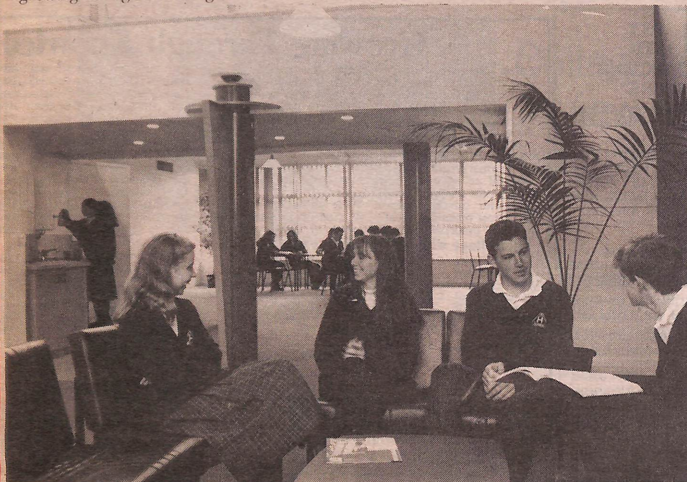
STUDENTS in the Senior Lounge: learning in an adult environment.

HEATHMONT COLLEGE growing through knowledge