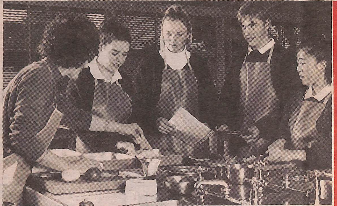
LEARNING about food, the pathway to a career in hospitality.

The college offers excellent modern facilities including large well-appointed classrooms, a school hall, media drama and art workshop areas, quality sporting and physical education facilities and advanced technology equipment.