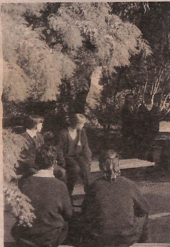
STUDENTS relax in the natural environment of the Heathmont Campus.

In short it will be a college at work, both for you to see, to have formal discussions with staff and generally shop around the 'supermarket'.