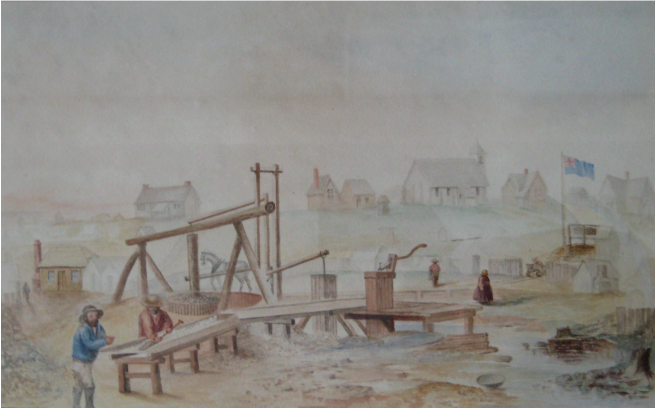
Claim of the Waterloo Mining Co., Golden Point, Ballarat [artist unknown] The church on the horizon is now a part of the SMB campus and is currently used by the School of Hairdressing

Classes commenced in the former Circuit Court House in Lydiard Street with 21 students enrolling in 1871 . Initially subjects were offered in Mining Engineering, Chemistry, Assaying and Mining Surveying. In 1910 the name changed to Ballarat School of Mines and Industries reflecting the growth of trade subjects.