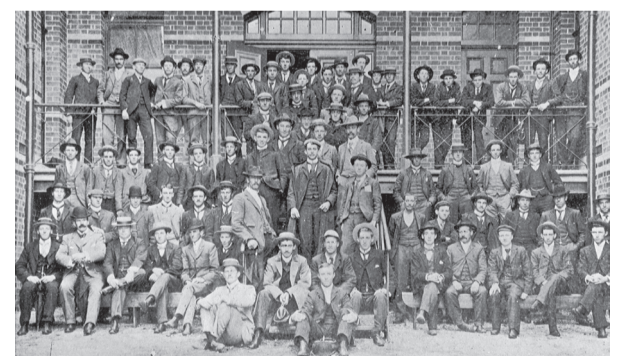
School of Mines Students c1901