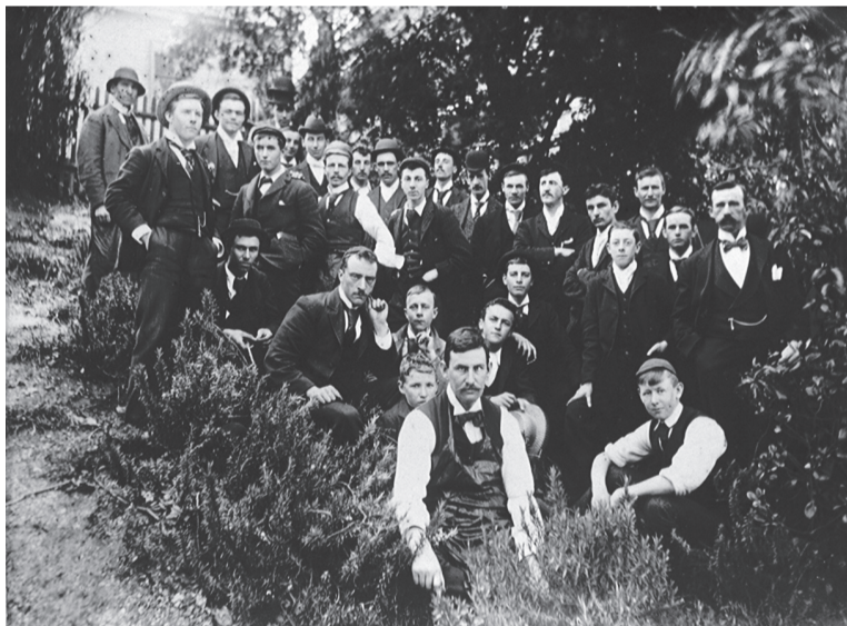
SMB students and staff in the Material Medica Gardens, c1897. Today large scale remnants of the gardens make a pleasing green space in the centre of the campus.