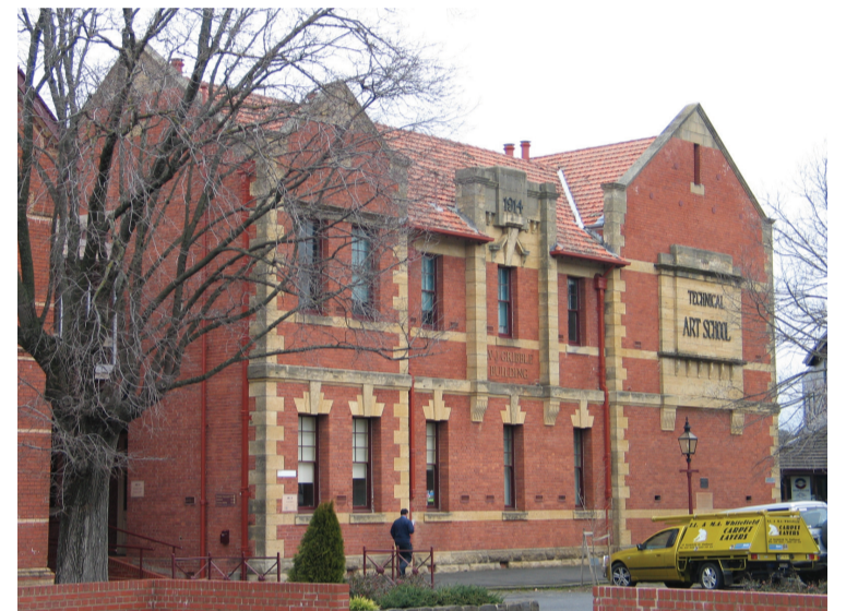
Ballarat Technical Art School