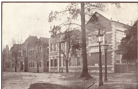
Ballarat Technical Art School, c1920.