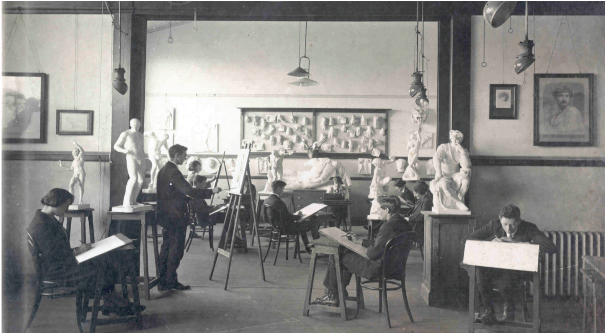
Drawing from the Antique, c1920.

THE OLDEST CONTINUOUS TERTIARY ART EDUCATION INSTITUTION IN AUSTRALIA