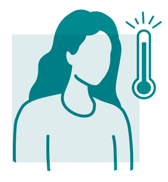
At first sign of any symptoms, get tested then stay home.