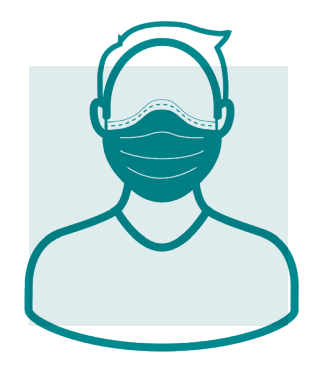
Keep a face mask handy at all times.