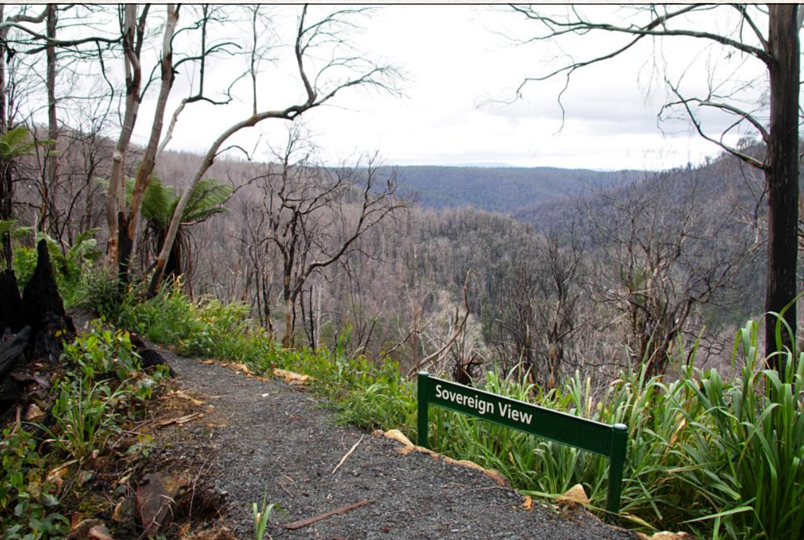
(Top) Cumberland Falls viewing platform - (Bottom) On the way to the Falls