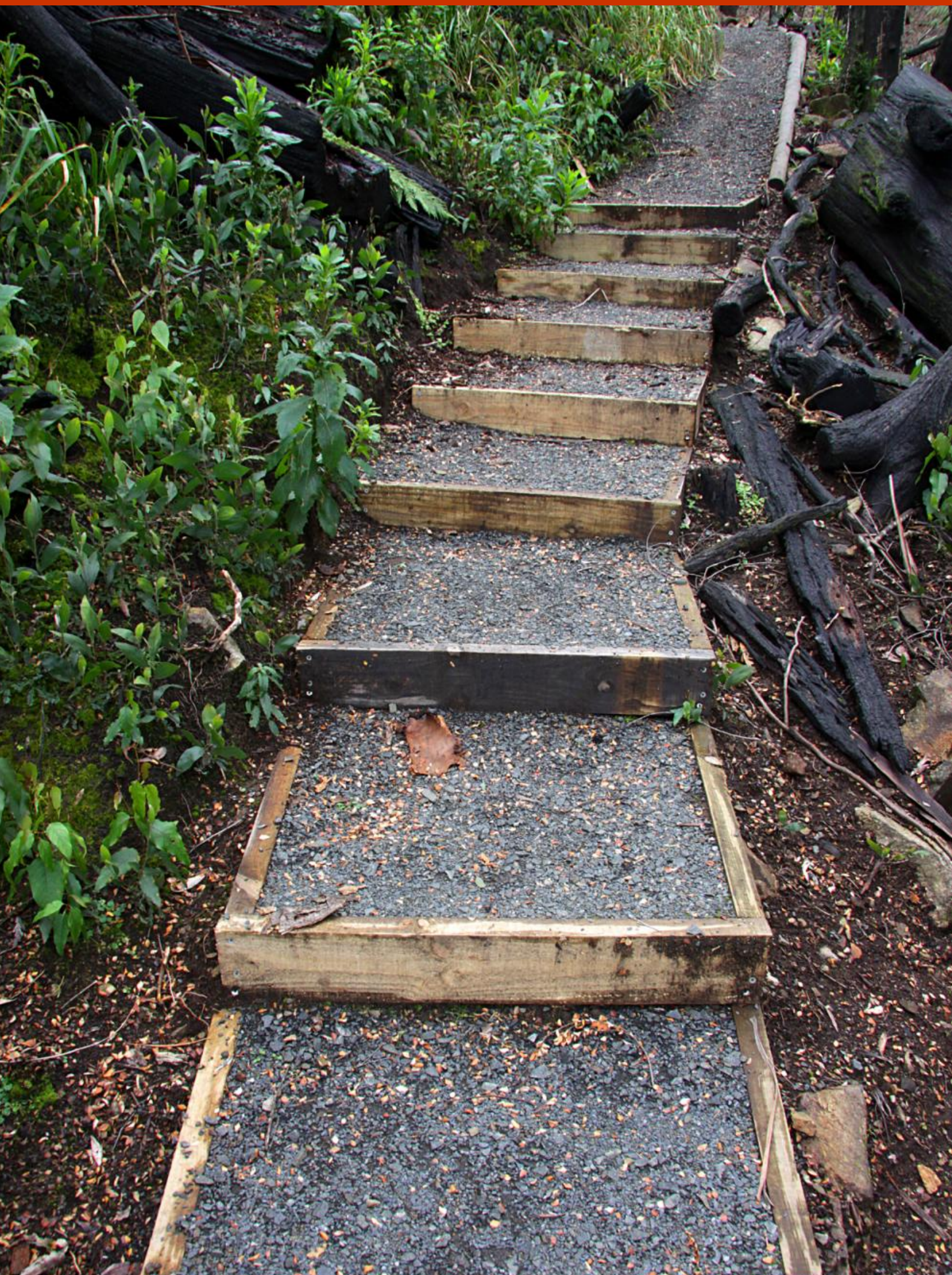
Steps leading down to the viewing platform