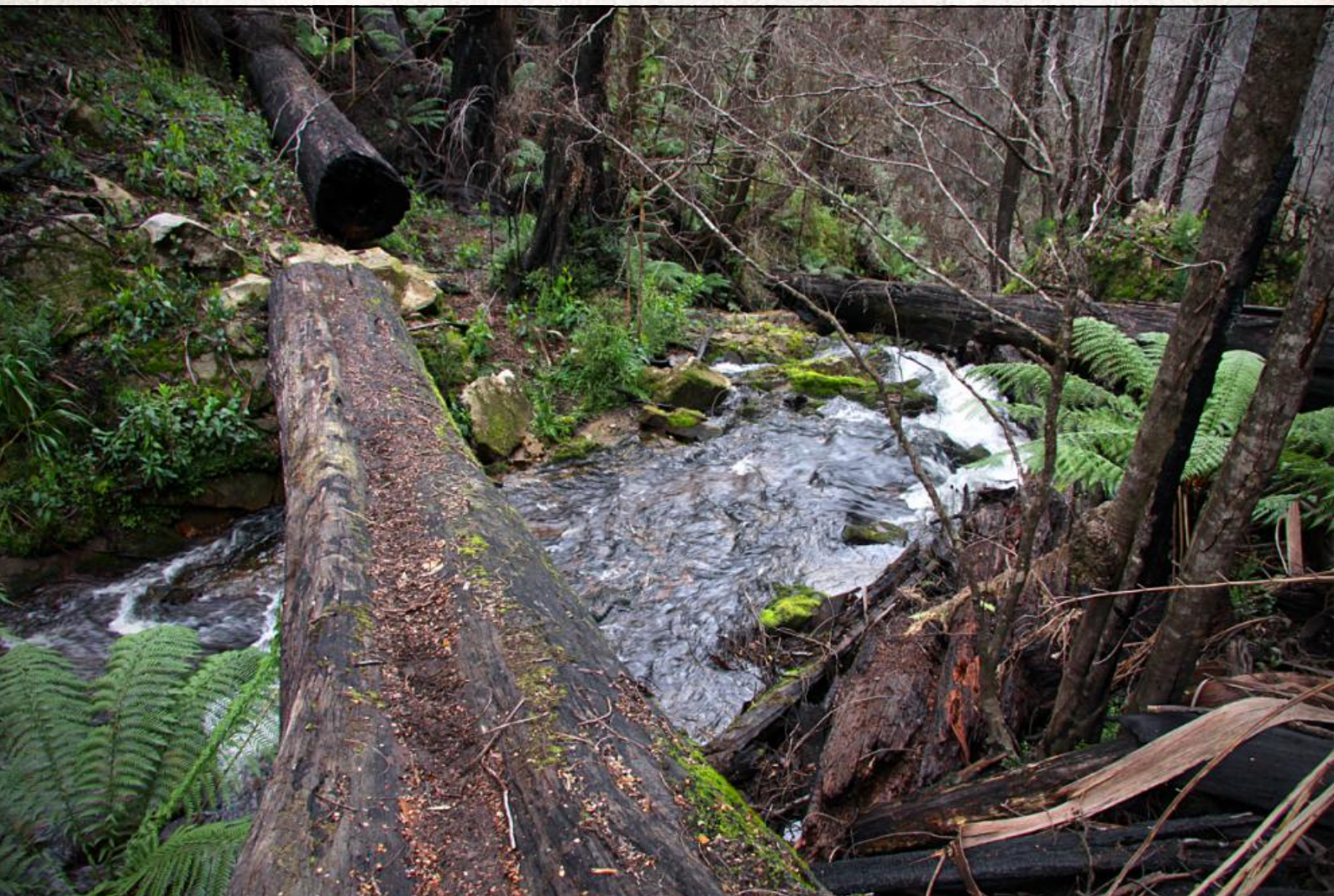
(Top) A bridge on the way to the Falls - (Bottom) A log near the top of the Falls