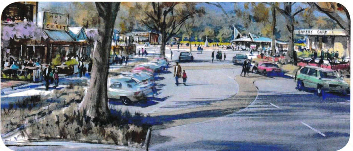
Marysville Urban Design Framework - Murchison Street, Artist's Impression

A3 copies of the plans can also be viewed at the offices of the Victorian Bushfire Reconstruction Recovery Authority, Murrindindi Shire Council's Alexandra Office, Marysville Community Services Hub and Marysville Central Information Centre.