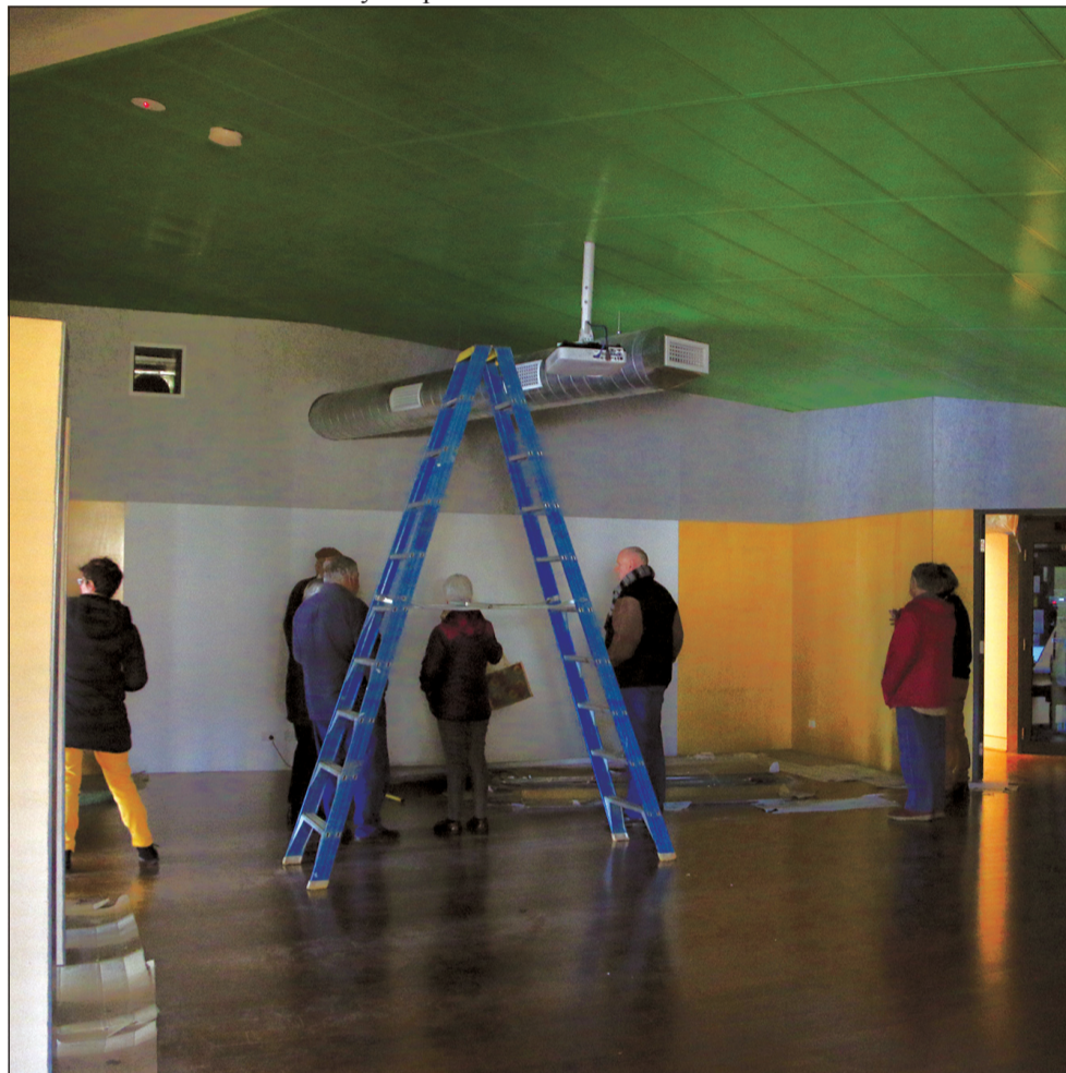
The stage and exhibition space at MIRA.