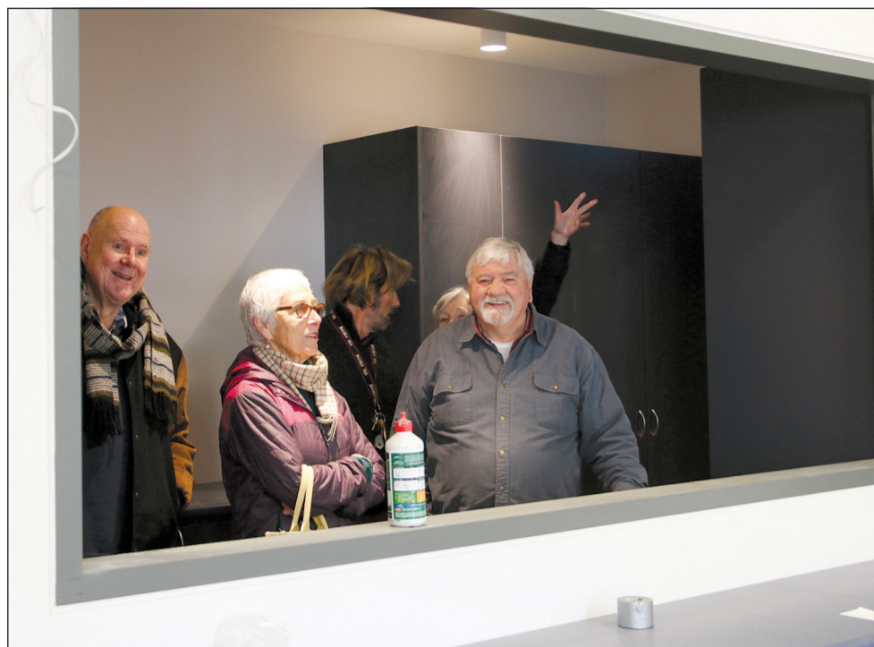
The view from the kitchen. -S