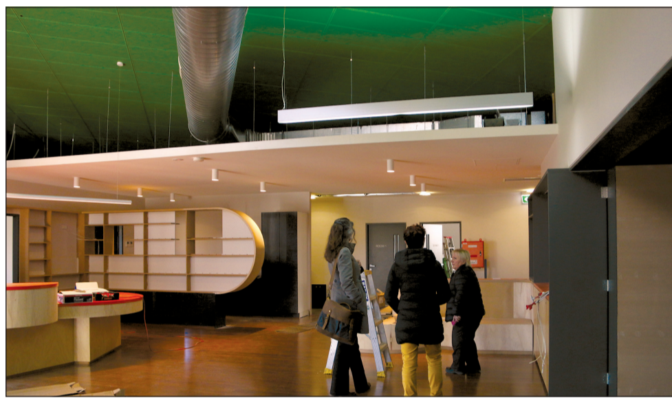
The visitor centre area. -AR