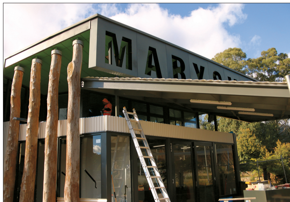
The keys are expected to be handed over at the end of July. -AR