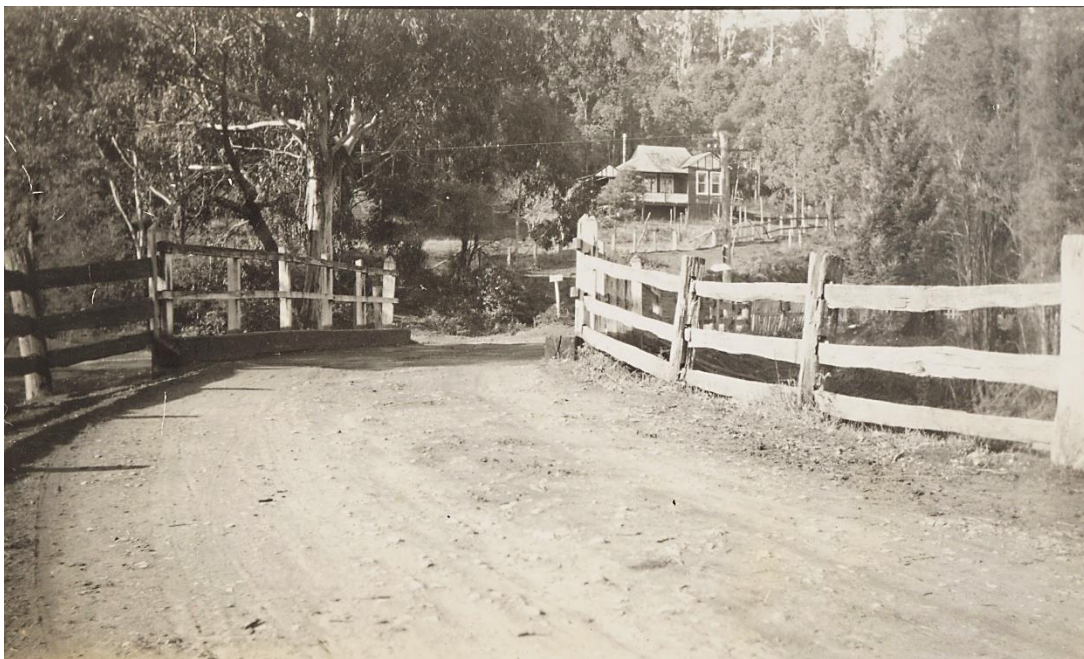
Labelled - Steavenson Hotel, taken by Rev Cox in SLV collection, not dated.

No written information can be found for the Steavenson Hotel after 1866 and this is the only known photo of the buildings. The date of early 1900s has been determined by the presence of the small police office top left which was built about 1902.