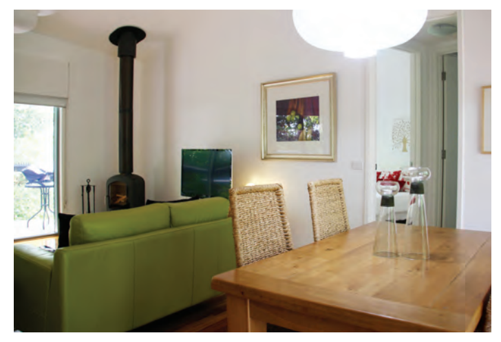
Murrindindi Guide – AUTUMN 2016 – 19