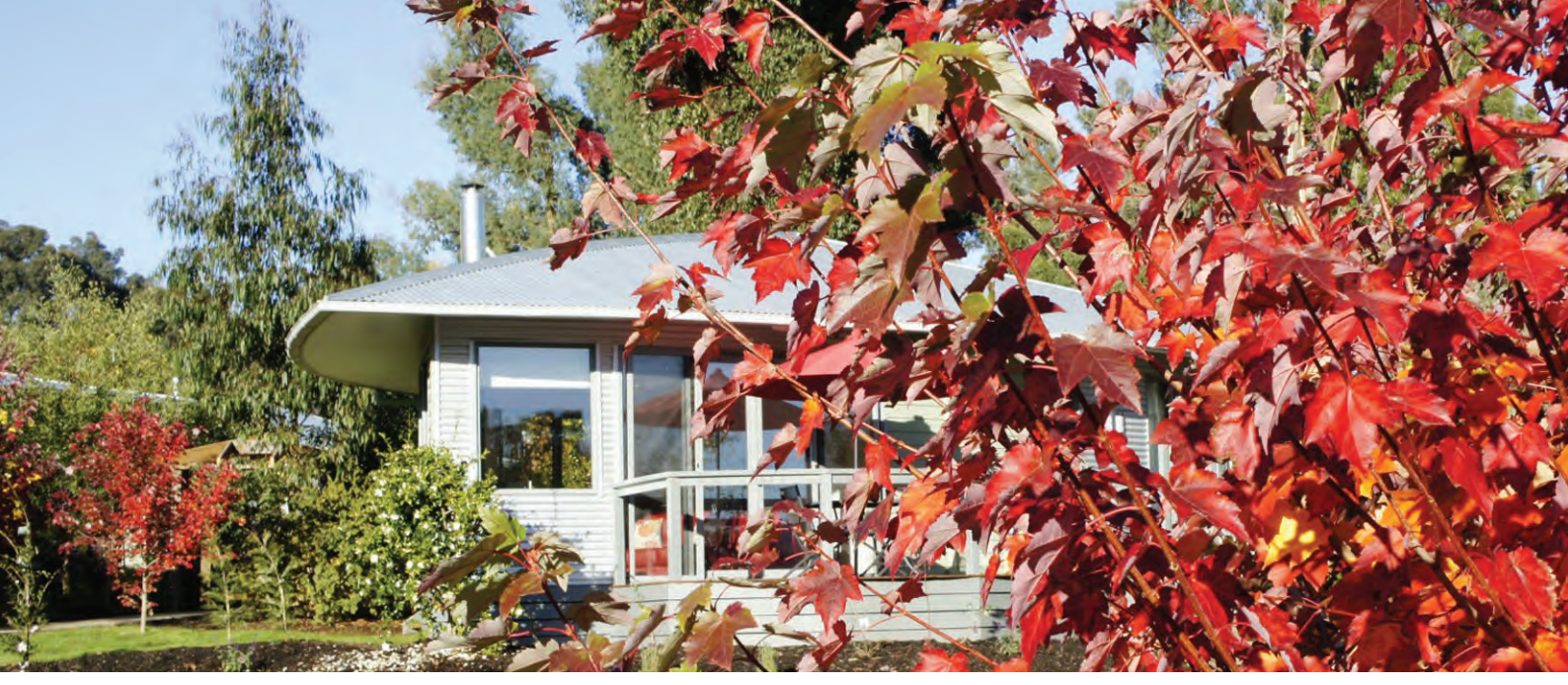
Tall gum trees, brightly coloured flowers and bushes along with hazelnuts, figs and kiwi fruit flourish in the gardens at Dalrymples Guest Cottages, providing the ideal home for birds and wildlife.

fate had something else in mind and attached to Amelina was a small holiday rental business.