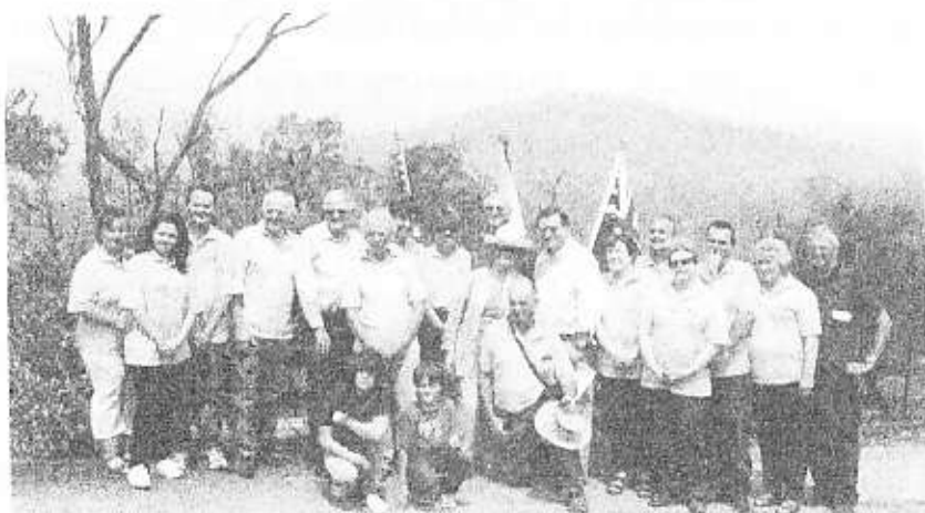
Marysville & District Lions members and Lions VIP's