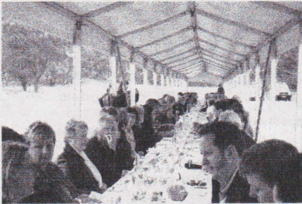
Above, part of the table set for 200 people