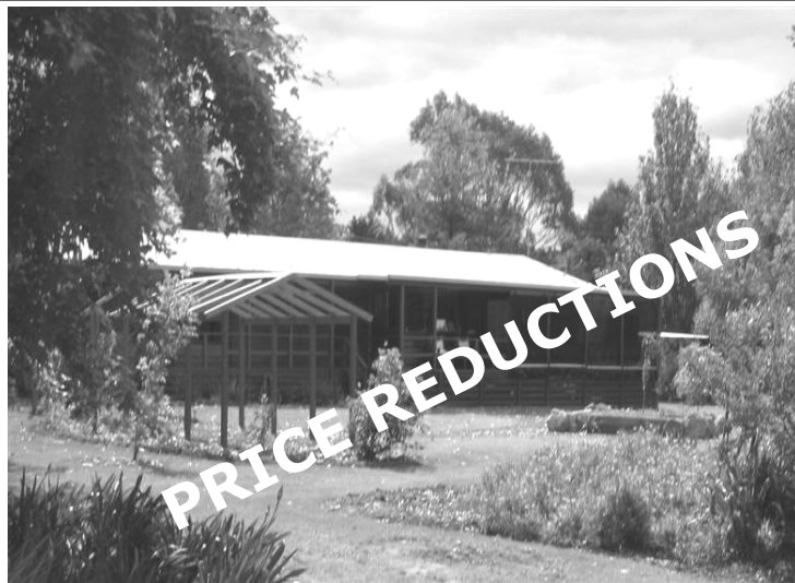
TAGGERTY $379,000 CEDAR HOME-IMPECCABLE PROPERTY! - 1.49 Ac

Quality Brick 7 Bedroom Home / 3 living areas / 3 Toilets Huge Open Plan Kitchen, Dining & living area Spacious BBQ Entertaining Area with Servery from Kitchen Shed 12mx7mx3m, Slab, Power, Lights, Alarm & Log Heater Extensive Vegi Garden, Potting Shed, Chook Shed & Woodshed Wheelchair Friendly, Town Water, Dam, Established Parkland Garden, 5 minute walk to Shops/Pub/Primary School