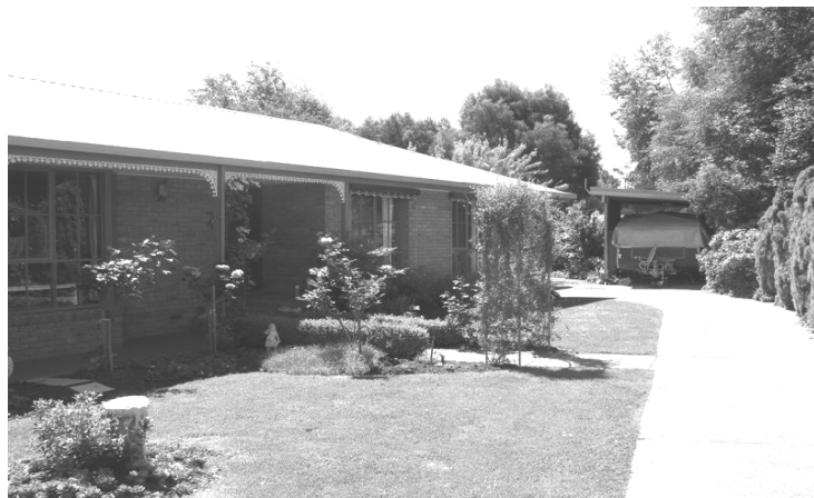
TAGGERTY $299,000 DELIGHTFUL HOME...DOUBLE ALLOTMENT

3 Bedroom Brick Veneer Home with 2 WIR's & 1 BIR. Living Room with Wood Heater & Split System. Formal Dining with Mt. Cathedral Range View from Bay Window. Impressive Parkland Garden – 2 Mega Litre Water Entitlement. Extra High Carport for Motor Home, Lock-up Garage & Workshop.