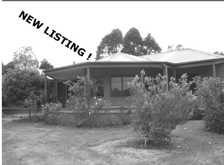
BUXTON $695,000 FAMILY & FRIENDS / TOURISM POTENTIAL