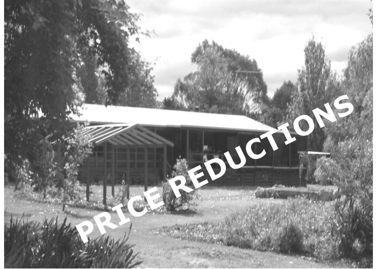
TAGGERTY $379,000 CEDAR HOME-IMPECCABLE PROPERTY! - 1.49 Ac

Quality Brick 7 Bedroom Home / 3 living areas / 3 Toilets Huge Open Plan Kitchen, Dining & living area Spacious BBQ Entertaining Area with Servery from Kitchen Shed 12mx7mx3m, Slab, Power, Lights, Alarm & Log Heater Extensive Vegi Garden, Potting Shed, Chook Shed & Woodshed Wheelchair Friendly, Town Water, Dam, Established Parkland Garden, 5 minute walk to Shops/Pub/Primary School