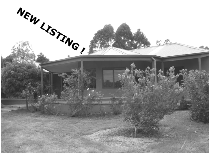
BUXTON $695,000 FAMILY & FRIENDS / TOURISM POTENTIAL