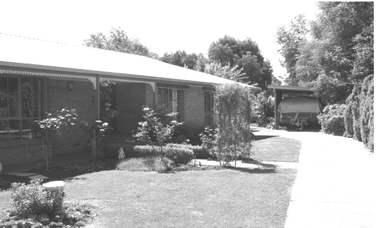
TAGGERTY $299,000 DELIGHTFUL HOME...DOUBLE ALLOTMENT

3 Bedroom Brick Veneer Home with 2 WIR's & 1 BIR. Living Room with Wood Heater & Split System. Formal Dining with Mt. Cathedral Range View from Bay Window. Impressive Parkland Garden – 2 Mega Litre Water Entitlement. Extra High Carport for Motor Home, Lock-up Garage & Workshop.