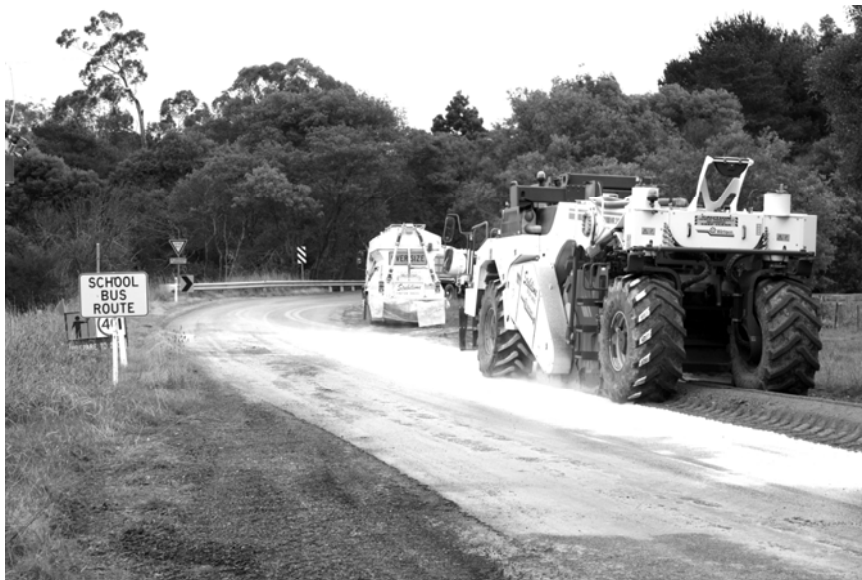
Photograph: Stabilisation works have commenced on Break O'Day Road.

"It is important that people do drive to the road conditions and respect that there could be some minor delays while the works are carried out."