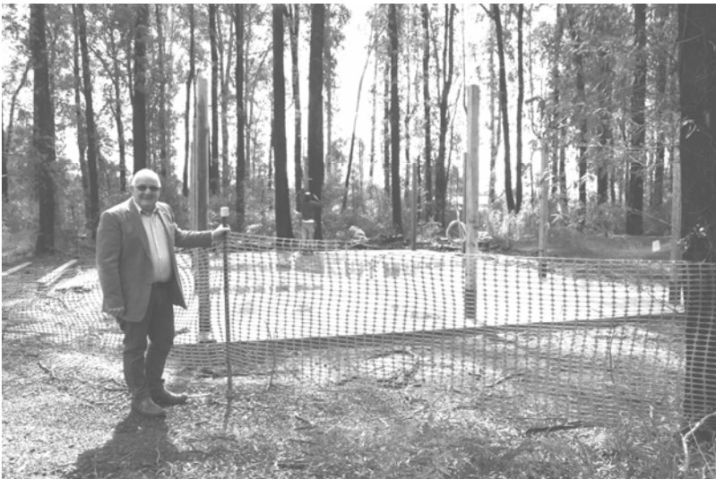
Councillor Bellingham inspects the progress of the barbecue shelter at the Narbethong Recreation Reserve.

The reserve already boasts a playground and further enhancement works include a toilet block and a picnic shelter which includes a barbecue.