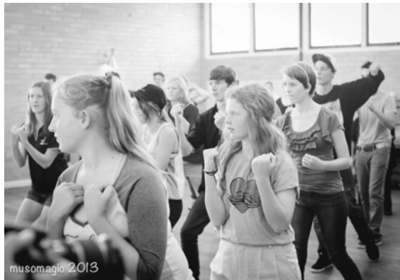
Photo: Young people from Yea High School and neighbouring shires rehearsing for the video clip.