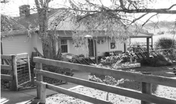
ACHERON $560,000 "HARTLEY RISE" 30 Acres Unique Farmlet...Rare Find !

Renovated 3 Bedroom Farm House with Office/Study. Featuring Queensland Spotted Gum Polished Floor Boards. Split System, Wood Heater, 2 Open Fireplaces & Ducted Heating. 9 Paddocks all watered by Dams & Troughs, with Laneway System. 4 Bay Shed & 3 Bay Machinery/Workshop. Steel Cattle Yards & Crush. Quality Grazing Land with Animal Shelter Sheds & GreatTree Cover.