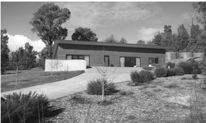
BUXTON $435,000 "THE ENTERTAINER" 1.49 Acres Modern, Spacious & Bright with Wonderful Outlook 5 Bedrooms BIR's, Master with Huge Walk-in-Robe. Stunning Kitchen with 2 Fan Forced Ovens. Featuring Polished Exposed Aggregate Concrete Flooring, Double Glazed Windows & Doors, Quality Fittings. Split System, Woodfire Heater & Ceiling Fans. 9x9m Shed/Workshop with Toilet & Hot Water, includes 2x20ft Shipping Containers for Secure Storage

"Eagles Nest" A Superb Paradise 10 Acres The craftsman built timber home exudes quality and presentation. Comprising 3 large bedrooms. Taking in breathtaking views across Mt Dom Dom, Mt Strickland and beyond the horizon. Striking bathroom with a double walk in shower, superb deep cast iron slipper bath. An ornamental lake, complete with fountain and majestic waterfall. A full length deck is an entertainer's delight with huge 8 person hot tub & stone pizza oven. Unlimited crystal clear spring water, a superb natural environment and a home of unique character is "Eagles Nest".