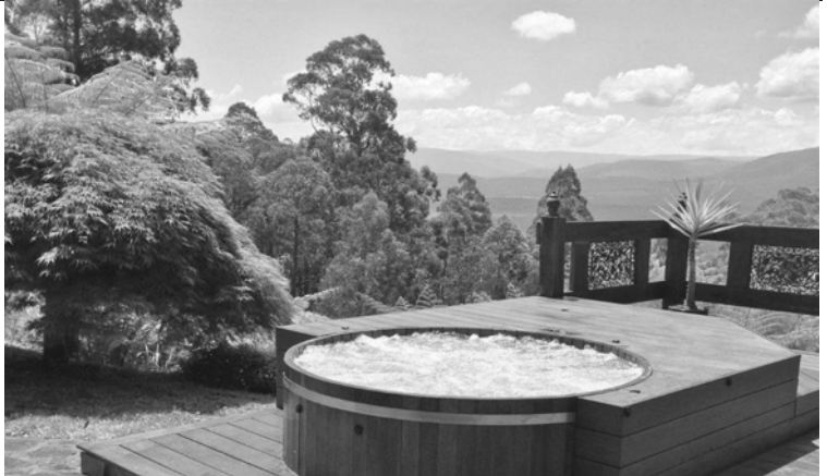
NARBETHONG—BLACK SPUR Contact Agent

Renovated 3 Bedroom Farm House with Office/Study. Featuring Queensland Spotted Gum Polished Floor Boards. Split System, Wood Heater, 2 Open Fireplaces & Ducted Heating. 9 Paddocks all watered by Dams & Troughs, with Laneway System. 4 Bay Shed & 3 Bay Machinery/Workshop. Steel Cattle Yards & Crush. Quality Grazing Land with Animal Shelter Sheds & GreatTree Cover.