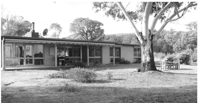
TAGGERTY $530,000 "KANIMBLA" 55 Acres Picturesque and Diverse

4 Bedroom, Modern, Light & Spacious Home, taking in the Wonderful Surrounds. Solar Power & H/W, S/S, Wood Fire Heater. Cleared Parkland Creek Flats, treed Hill Country with good access. A Lake with Island, Windmill & Pump. 3 Dams & Rain Water Storage. Well Established Olive Grove, Citrus, Enclosed Vegi Patch & Blueberries. Excellent Shedding: Open Bay, Workshop, Wood, Hay & Stable. Stunning Outlook in all Directions. Quiet Private Location, Sealed Road Frontage. Impressive !